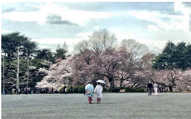
Figure 3: Tokyo, 2018.

Meaning has become a paradigmatic problem for postmodern architecture and of understanding everyday lives. The aesthetic elitism of modern architecture, the failure of it to deliver social progress and, above all, the increasing prosperity of the United States middle class has generated a need for meaning - a need for something different. Everyday activities are understood in this paradigm as rituals: activities that have a personal meaning for the user. An illustration of this is the return to tradition in many cultures of the world. An example is the custom of dressing in traditional clothes by Japanese during the cherry blossom festival in Tokyo (Figure 3). Residents take pictures of themselves in traditional costumes in a Tokyo city park: an illustration of a postmodern clash of tradition and the digital age.