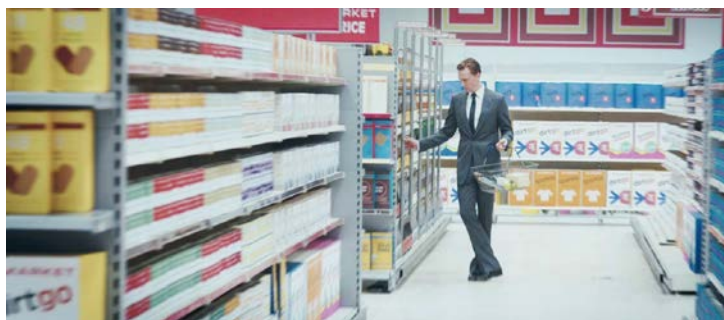
Figure 1: A still from the movie, High-Rise (2016), directed by Ben Wheatley.

A very telling example is the relationship between everyday life and the surroundings. In the case of modernism, the movie, High-Rise (Figure 1), a film adaptation of J.G. Ballard's novel, points to the mall as an icon of modern life [2].