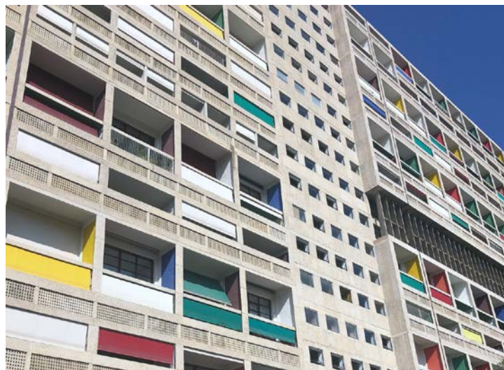
Figure 2: Unité d'habitation , Le Corbusier, 1945.

This image portrays a fast, effective life and the modern architecture that creates the experience. This contrasts with the image known to every student of architecture: the Unité d'habitation by Le Corbusier (Figure 2). The purpose of the comparison is to indicate the impact of architecture on the everyday lives of its users. It is important for students of architecture to recognise the impact of the architectural space that architects design on the experience of users of that space.