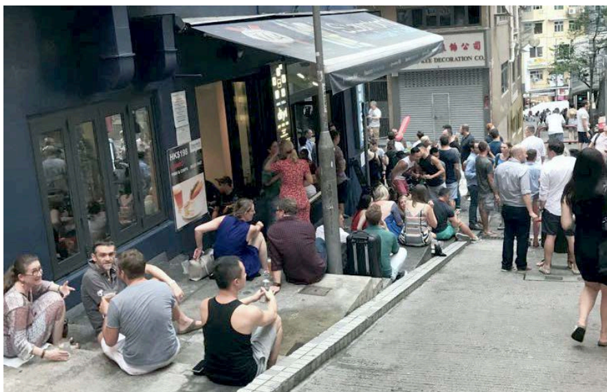
Figure 5: Seoul, city life, 2018.

Architectural space is not an important aesthetic object of experience for people in Figure 5. What is important goes far beyond aesthetics and is founded in interaction - between users and between user and space.