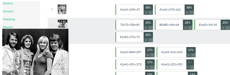
Fig. 2. Detected faces.

are not necessary as they are done arithmetically using the player's device processing power. The detected faces were further verified – for 92 images we got 181 verification responses and 7 reports.