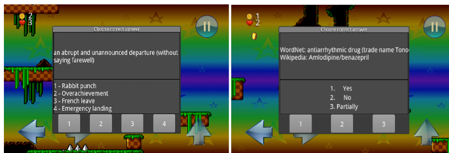
Fig. 1. TGame user interface (left: extended mappings, right: yes/no question).