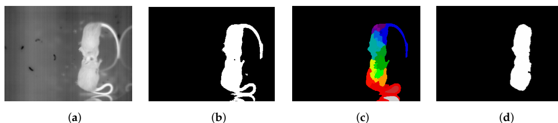
Figure 1. Results of the most popular algorithms used for segmentation of (a) original image by: (b) Otsu's thresholding, (c) watershed with gradient regions markers, (d) U-Net—semantic segmentation.

The automatic analysis of rodents from video recordings requires the identification and tracking of each animal in a scene. The distinction between the object and the background in animal tracking visual systems is most often based on difference between frames, color threshold or color matching [13]. A clear temperature difference in thermal imaging greatly simplifies foreground-background segmentation. Usually, the Otsu's thresholding supported by morphology is enough [2,14]. Figure 1b demonstrates the result of Otsu's thresholding on thermal image. In a cluttered environment there is also a need to segment the object from other parts of the foreground or to distinguish individuals from each other. For small connections of the animals' bodies, methods such as marker-controlled watershed segmentation technique are sufficient [15]. However, the solution to the segmentation problem for the objects that overlap significantly is not easy and most image analysis methods fail. Figure 1c shows the results of rodent segmentation using watershed technique with markers build from the low gradient regions. There are no clear differences between the images of both objects and no border between them is visible. For these reasons a significant number of systems analyze only one individual at a time [2,13]. That is why the correct segmentation between objects is necessary for further analysis.