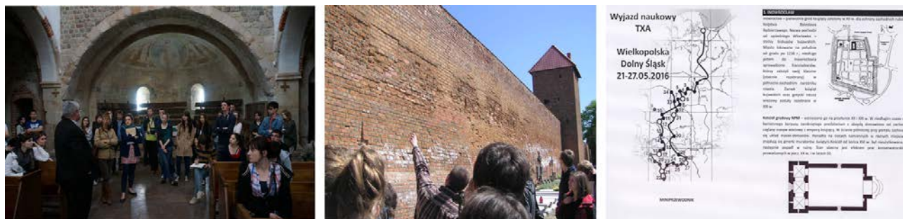
Figure 1: Students participating in the study tour classes (left and middle); an extract from a typical student guidebook, prepared before the study tour (right).

Students prepare for the tour by making mini guidebooks. They contain plans, sections of objects and the most crucial information (Figure 1). They help in recognising historical architecture and memorising its features. They are also a place to record comments and observations. Apart from domestic Polish tours, visits to selected European cities are also organised. These tours aim to expand knowledge about trends in architecture from neighbouring countries. They usually complement knowledge of Polish buildings, identifying similarities and differences.