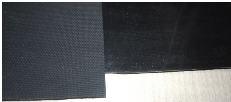
Fig. 2. Two types (outside and inside) EPDM membranes – visible different surface features on the backside

Diffusion properties of thin products (e.g. EPDM membranes, vapour retarders, waterproof membranes, etc.) are most commonly described with the help of the water vapour diffusion-equivalent air layer thickness s_d (m). The water vapour diffusion-equivalent air layer thickness s_d is defined by the following relation [37]: