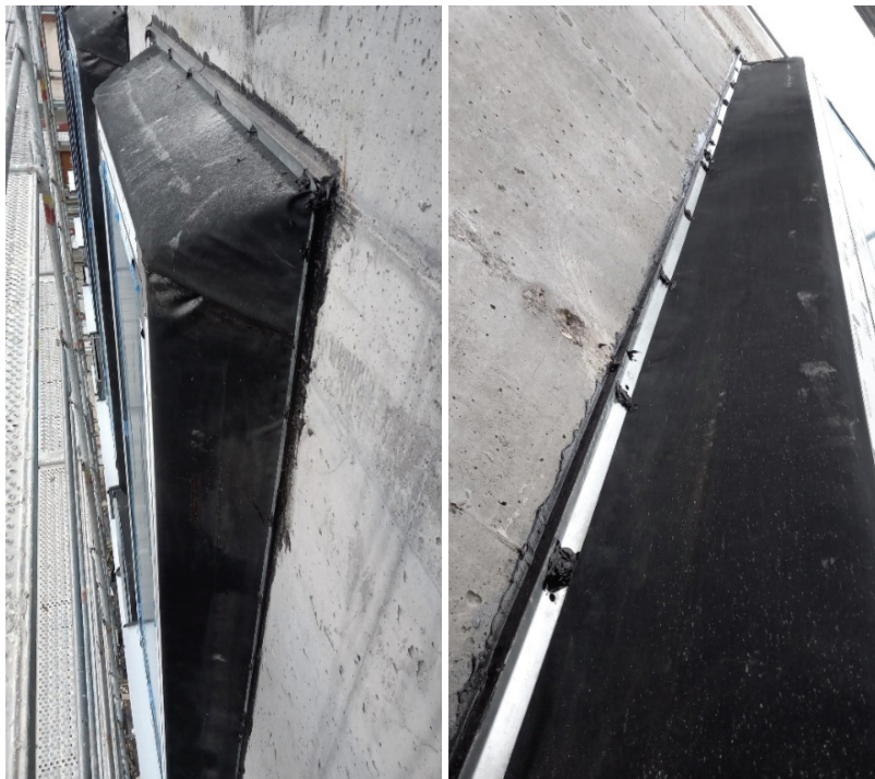
Fig. 1. Outside apron EPDM membrane in a window façade system fastened to reinforced concrete wall

In window and façade systems, the high-performance EPDM (ethylene propylene diene monomer) rubber membrane is also applied for permanently sealing around building penetration points (e.g. around in windows, see Fig. 1). In the case of glass curtain wall systems, the usage of a galvanized sheet steel pan in the spandrel area is performed for vapour diffusion control and air leakage control. The sheet steel is sealed at the perimeter of the frame spandrel and is impermeable to moisture and it is positioned on the warm side of the insulated assembly. Each façade and window systems are limited and have some advantages and disadvantages which influence the costs of façade system implementation, see e.g.: [3, 28, 33, 44]. Nevertheless, the physical properties of partitions have to be detailed studied and analysed. EPDM materials have many applications in different fields of industry. EPDM is a naturally elastic material, with over 300% elongation, even at extremes of temperature. The applications of the EPDM are wide and used also to develop new composite materials, see e.g. [10, 17, 19, 21, 45] and others applica-