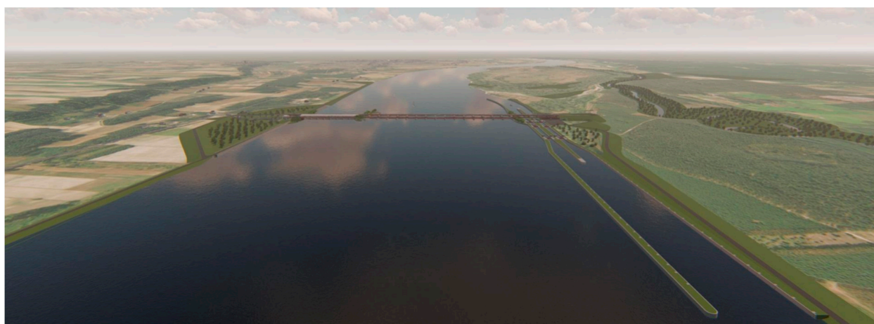
Figure 3. Conceptualization of the barrage on the Vistula River (Siarzewo Dam) [50].