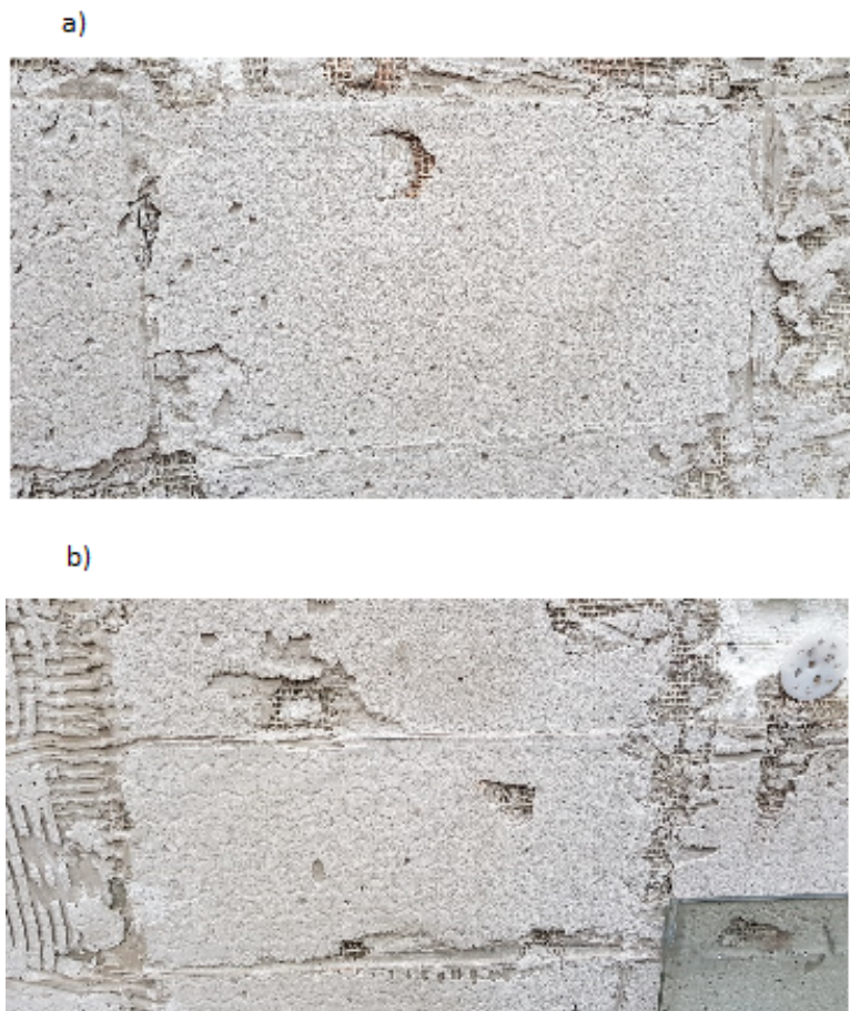
Figure 3. Mechanism a), b) (method of detaching) the ceramic cladding of the building facade