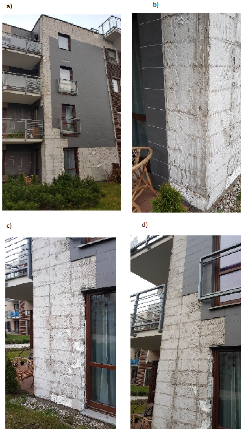
Figure 1. Damaged ceramic cladding a), b), c) and d) of the building facade

Fragments of the facade made in the ETICS (BSO) technology, on which the finishing layer was a facade plaster (textured layer), after three years of operation, did not show any significant defects or damage. On these parts of the facade, there were no visible traces of blistering, delamination and detachment of the texture layer itself, as well as the adhesive (reinforced) layer.