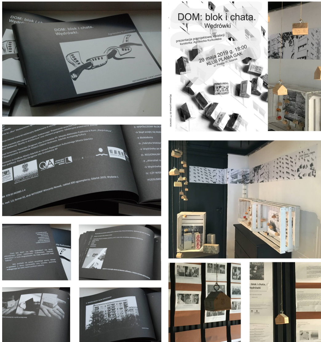
Figure 3. The book entitled " DOM: blok i chata. Wędrowki. [HOME: block of flats and cottage. Wandering]. ", VII. 2019 Gdańsk PLAMA GAK exhibition, Gdańsk-Zaspa, May 2019, curator: A. Kurkowska

attempts at situating and verifying the building models with the results, looking for the potential of various locations.