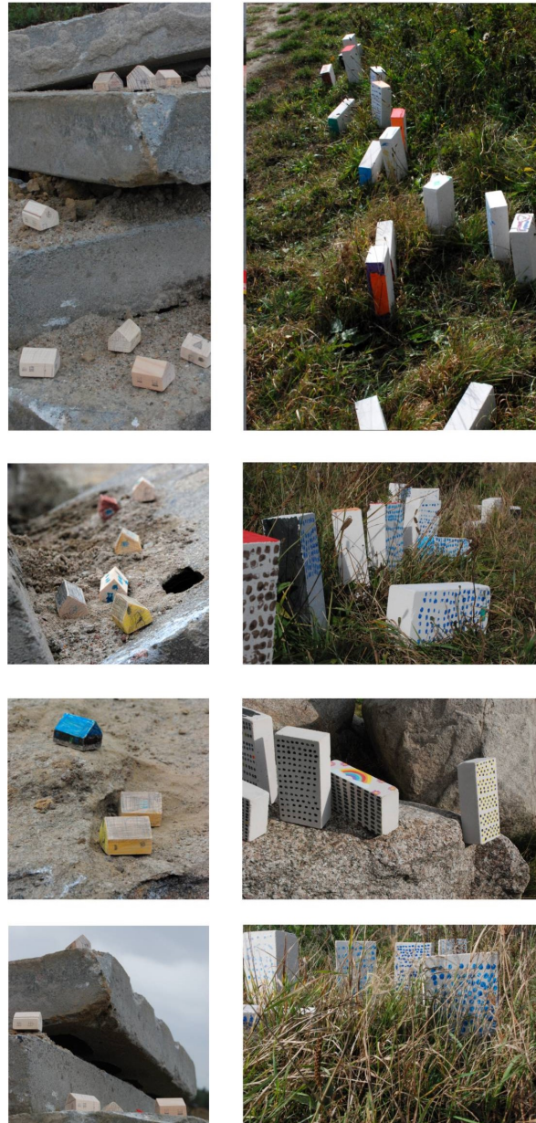
Figure 2. Workshops for children as part of the project entitled “ZASPA: dom w bloku. Przestrzenie archiTEKTURY” [ZASPA: a house in a block of flats. The spaces of architecture]”: wanderings.

material to work on. Windows were stamped onto it in order to resemble a large number of identical apartments.