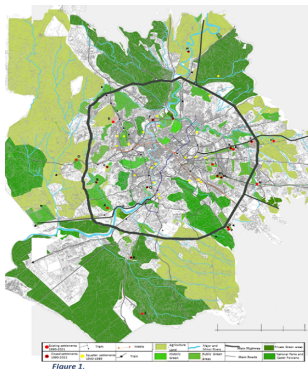
Figure 1. Analysis of squatter settlements and campo nomadi of Rome, from 1950-1980, and 1990-2021.