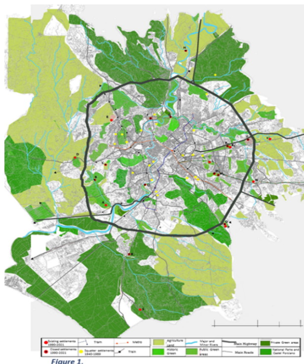
Figure 1. Analysis of squatter settlements and campo nomadi of Rome, from 1950-1980, and 1990-2021.