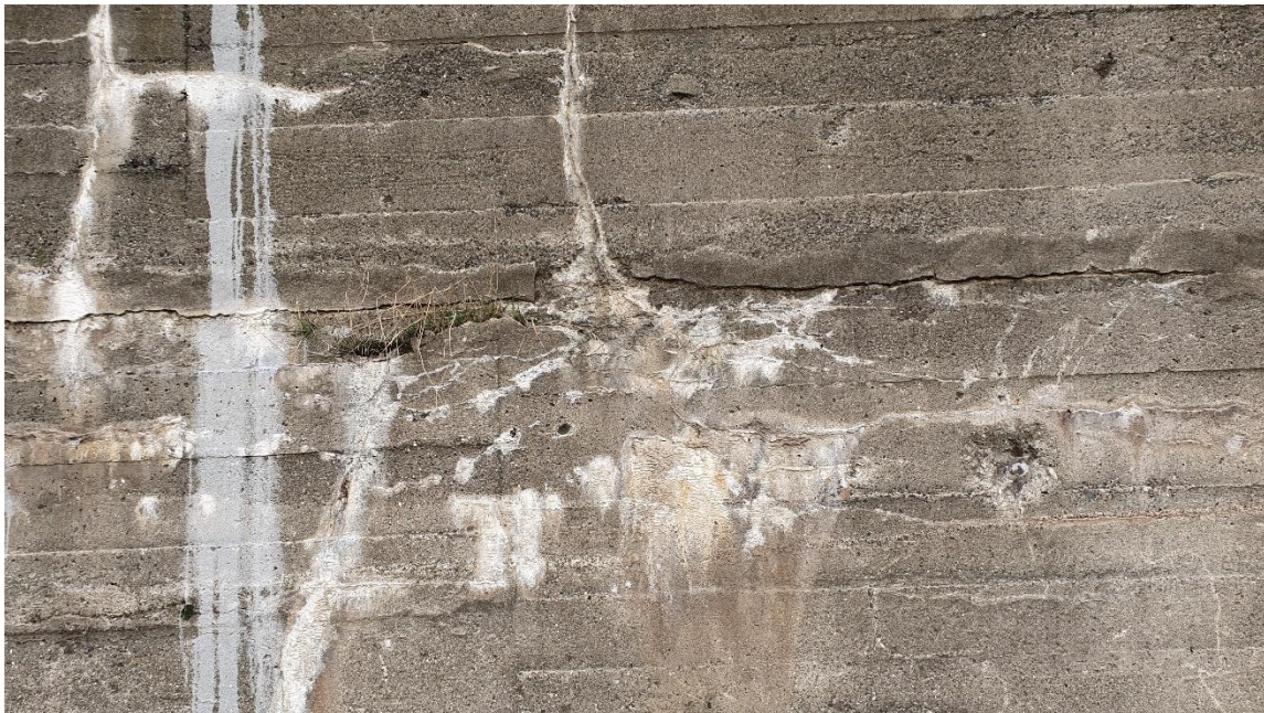
Photo 2: Examples of calcium carbonate leaks on the south-west elevation (external gable (transverse) wall from the land side (left)) of the Bunker building