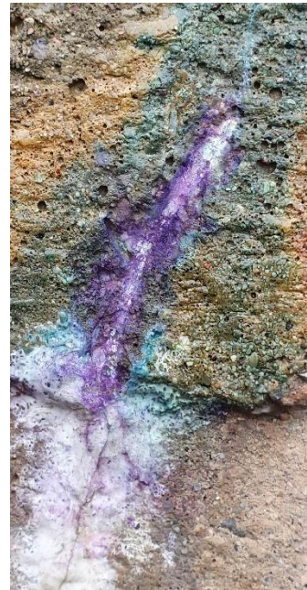
Photo 5: Discoloration of concrete after the Rainbow Test on the concrete surface, in the place of a crack on the wall of the right annex - test site after the test: a) view, b), c) close-up: green-violet coloration indicates advanced carbonation of concrete and its reduced ability to protect the reinforcement, the orange color indicates advanced carbonation of the exposed concrete surfaces, washing out of calcium carbonates is visible in the area of cracked concrete fragments