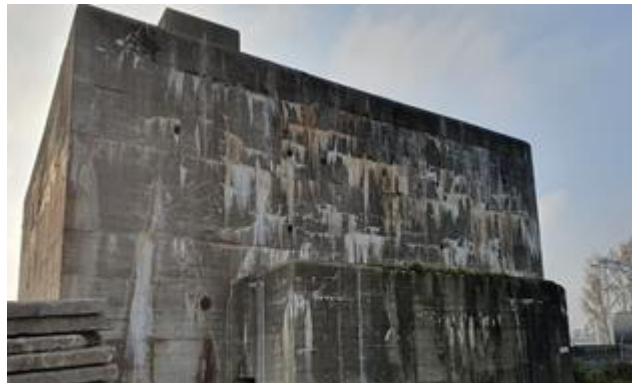
Photo 1: Bunker building elevations: a) south-east: external longitudinal (front) wall from the land/water side, b) south-west: external gable (transverse) wall from the land side (left), c) north-east: external gable wall (lateral) landward (right)