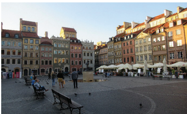
(a) Warszawa: Old Town Market

Although, paradoxically, this specific concept of post-war reconstruction—defined as a means of restoration of the centre of national identity, the Old Town of the Polish capital—was also used to recreate the centres of former German cities such as Wrocław (Czerner, 1976; Małachowicz, 1985) and many others, including Gdańsk (Massalski & Stankiewicz, 1969; Stankiewicz & Szermer, 1959; Szermer, 1971; Figure 2), it was applied to very