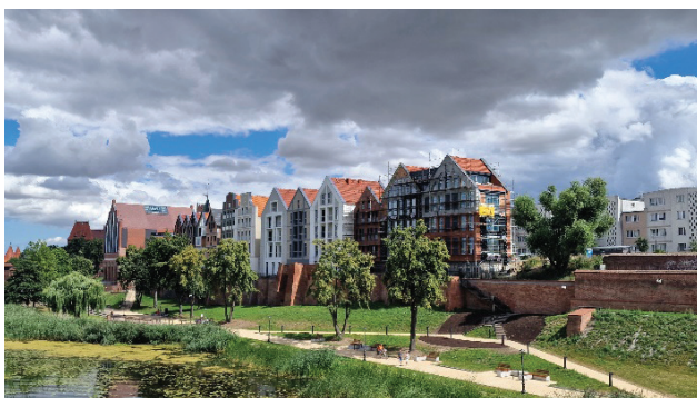
(c) Malbork: New complex in the forefront of the Old Town