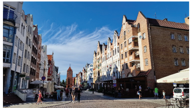
(b) Elbląg: Stary Rynek Street