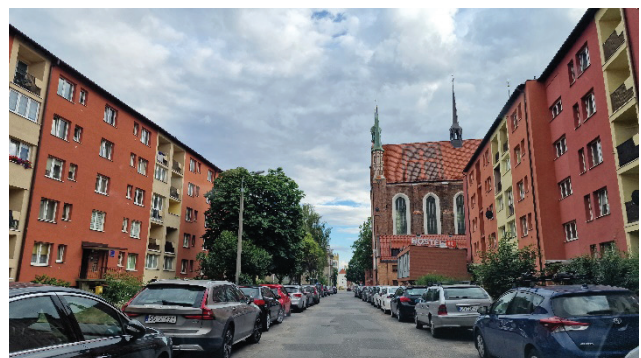
(d) Gdańsk: Rzeźnicza Street