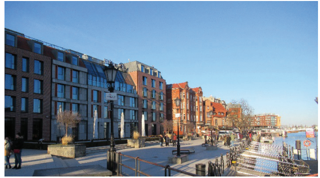
(b) Gdańsk: Long embankment