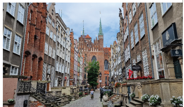
(d) Gdańsk: Mariacka Street