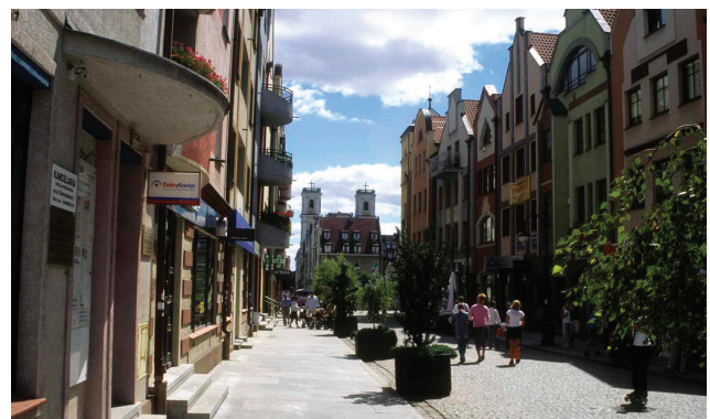
(d) Głogów: Grodzka Street