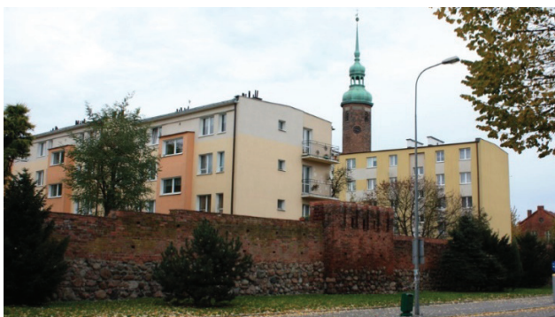
(c) Słupsk: Old Town as seen from Jagiełły Street