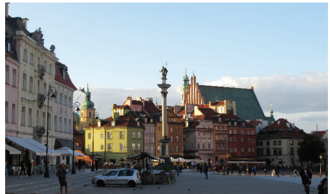
(b) Warszawa: View of the Old Town and Royal Castle Square