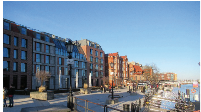
(b) Gdańsk: Long embankment