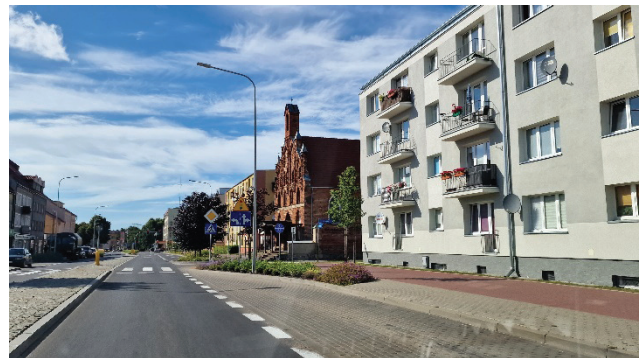
(b) Braniewo: Kościuszki Street