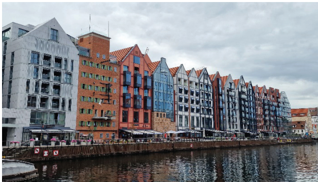
(a) Gdańsk: Granary Island