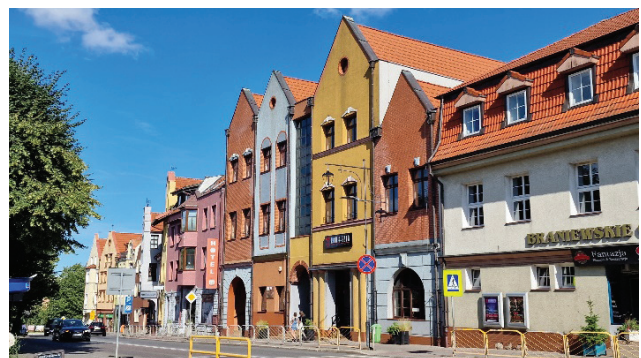
(d) Braniewo: New complex in the vicinity of the Cathedral Church