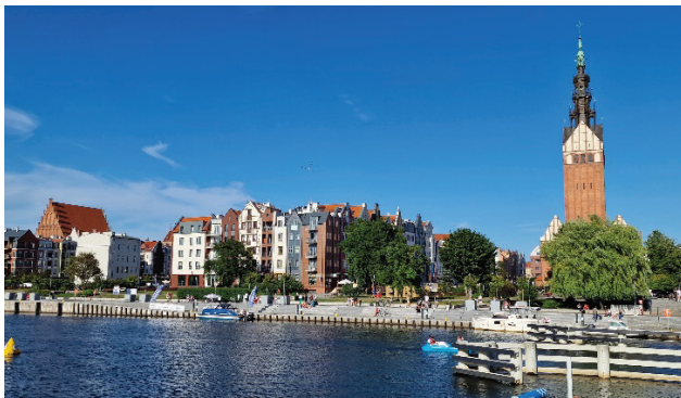
(a) Elbląg: Old Town as seen from the Granary Island

This idea clearly indicates the need to return to the foundations of the European city model in its scale and structure. The concept of "retroversion"—conceptualised by Maria Lubocka-Hoffman—was developed in parallel to the European discussion on reinstating the urban identities of historic cities through the creation of neo-traditional urban and architectural forms (Lubocka-Hoffmann, 2008). Leon Krier, one of the main proponents of this approach, noted that the manner in which German cities were built after the war led to the destruction of their regional identity to a much greater extent (leaving only 15% of the historic tissue) than the "bombs during the war" (after which it was supposed to survive up to 60% of the historic fabric; Krier, 1984). In this context, also in Poland, instead of building new cities on a human scale, architects and city planners once again faced the problem of recreating historic cities. Following the Elbląg experience, other cities also started to play with this concept, i.e., Głogów and Szczecin (Figure 4; Fiuk, 2017). And unlike the case of the two preceding periods, there were no strong political or economic reasons associated with introducing this mode of rebuilding old towns (Skolimowska, 2013). The main driver of this wave of reconstruction was, therefore, twofold: The local communities wanted the hearts of their cities restored, and, at the same time, local authorities realised the absurdity