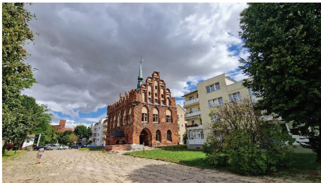
(a) Malbork: Old Town Hall within the rebuilt structures of the Old Town

Since the late-1950s, on many such sites, new districts have been erected in the style of socialist modernism , increasingly departing from the traditional model of the European city. What also made this period different from the Stalinist era was the fact that rebuilding processes were undertaken in the case of many cities, including numerous small and medium-sized ones. In these cases, new housing districts have been developed with the usage of industrialised technology on a large scale (Skolimowska, 2013). One such realisation is Malbork’s Old Town—as well as Braniewo, Kwidzyn, Kołobrzeg, Nysa, Legnica, Lwówek Śląski, and secondary old towns in larger cities, such as Stare Przedmieście in Gdańsk or Nowe Miasto in Wrocław (Bugalski, 2014; Figure 3). The author of the rebuilding concept for Malbork, Szczepan Baum, argued that there can be no compromise or intermediate phases between a strict historical reconstruction and the contemporary shaping of space (Baum, 1961). Indeed, although Malbork’s Old Town layer loosely refers to the historical city plan, it is almost impossible to identify former public spaces of the city with its main compositional axis of the elongated