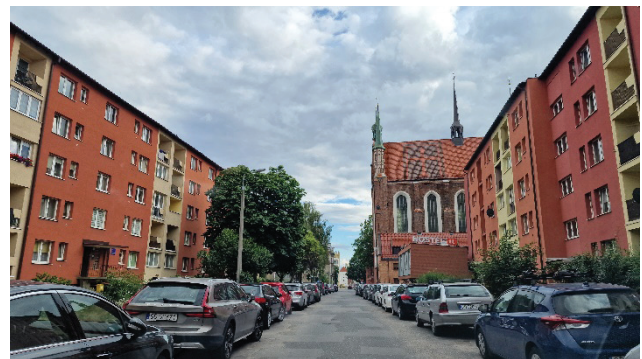
(d) Gdańsk: Rzeźnicza Street