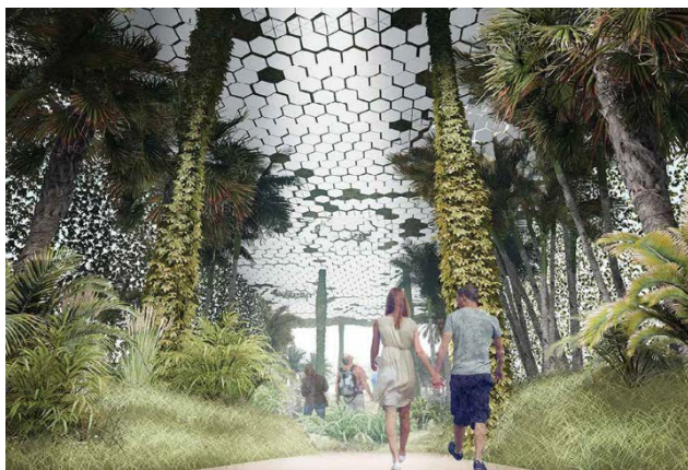
Figure 3: Invisible Architecture . Created by: Anna Jeziorska and Paulina Gudzińska, Faculty of Architecture, Gdańsk Tech.

Interestingly self-sufficient constructions were developed by students for two opposite scenarios. In the first one, buildings were embedded in a post-apocalyptic environment or in inaccessible regions and designed as capable of providing oxygen and producing food, sometimes equipped with separate mobile elements (Figure 4). In the other one, they were encrusted in dense urban structures as independent constructions with rotating elements adjusting to the quality of light and wind conditions. Buildings resembling natural formations were equipped with architectural meta-seeds, in the form of mobile modules that may travel to even distant places. This speculation on unrooted architecture took also the form of living compartments floating on the water or transported by drones to changing locations.