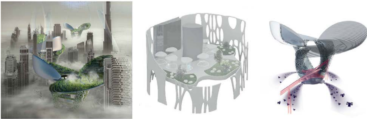
Figure 2: Flying Tomorrow . Created by: Jakub Sokółski and Łukasz Staniewski, Faculty of Architecture, Gdańsk Tech.

The surge toward a return to nature, blurring the boundaries between the architectural object and the environment, between the built and the organic appeared as the most explored path toward the architecture of the future. To develop such scenarios students planned for the new means of transportation, such as transportation drones or a hyperloop (high-speed transportation), used materials with a negative angle of reflection making the surfaces invisible, materials that change colours to provide energy benefits or organic materials, such as algae for the production of biomass (Figure 2 and Figure 3). Instead of increasing carbon emissions - buildings were designed as microclimate installations that bring benefits to the environment. Green buildings were presented as covered with layers of vegetation and equipped with vertical living walls inspected by automated horticulture robots. Floating objects were conceptualised as growing structures fabricated from filaments made of micro plastic extracted from oceans by controlled strains of bacteria.