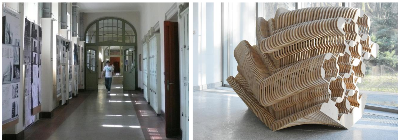
Figure 2: Long corridors as a space for circulation according to the 19th Century French Academy tradition and the in-between space for experimentations - 3D modelling laboratory.

Strict symmetry was used in the plan of the main building, with long corridors that enabled circulations and provided entrances to utility spaces - lecture rooms with rigid rows of desks facing slightly elevated stands for lecturing ex-cathedra. The separation between spaces for movement and spaces for static positions was rigorous according to the French theory. The strict layout of long corridors and sequence of rooms did not allow for any unambiguous spaces. Despite the strict division between circulation spaces and learning spaces and the rigid arrangement of learning units, the grand scale of the space allows today for using corridors as a venue for exhibitions (Figure 2).