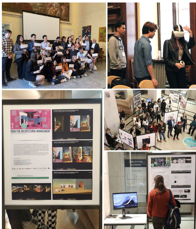
Figure 7. Exhibition of the students' works created during the workshops, held in October 2022 at Gdańsk Tech.