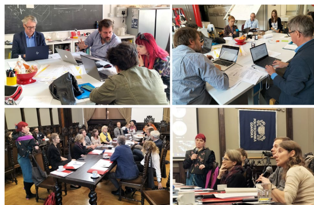
Figure 4. Planning meetings between the groups of teachers of the various disciplines involved to discuss the distribution of credits and the specificities of the individual courses within the programme.

The activities envisaged during the project (15 months) were as follows: (i) design of shared services, procedures, and regulations, structured by the administrative staff of the international and didactic administrations of the participating universities to support training and mobility within the programme; (ii) design of didactic and training aspects of the future programme by senior and junior academics supported by administrative staff with the specific aim of obtaining formal accreditation; (iii) design of communication and promotion measures, to ensure worldwide relevance of the programme regarding the field of Engineering and Architecture and its EU attractiveness.