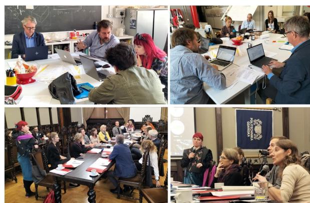
Figure 4. Planning meetings between the groups of teachers of the various disciplines involved to discuss the distribution of credits and the specificities of the individual courses within the programme.

The activities envisaged during the project (15 months) were as follows: (i) design of shared services, procedures, and regulations, structured by the administrative staff of the international and didactic administrations of the participating universities to support training and mobility within the programme; (ii) design of didactic and training aspects of the future programme by senior and junior academics supported by administrative staff with the specific aim of obtaining formal accreditation; (iii) design of communication and promotion measures, to ensure worldwide relevance of the programme regarding the field of Engineering and Architecture and its EU attractiveness.