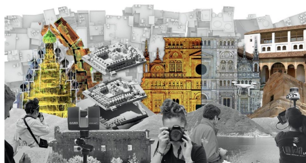
Figure 2. The databases on heritage, on the city and on architecture in general configure archives in which the real space and the qualities of the environments are discretized and reconfigured through spatial characteristics and attributes that describe the character of the places. The digital space draws from the real dimension and digital duplicates, digital twins, today constitute a possibility for transferring and preserving the memory of places, as well as for increasing their narrative possibilities by favouring management and enhancement processes.

VREA design measures are aimed at examining, from the perspective of Architecture and Engineering Faculties towards Digital Survey and ICT cutting-edge strategies, how the recent developments in service-oriented architectures could be used to enable new approaches to digital enquiry in the arts and Cultural Heritage. (Fig.2)