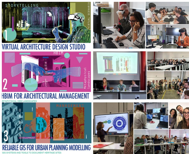
Figure 5. The Pavia Digiweek 2022, including conferences, seminars and workshops, was an opportunity to experience the effectiveness of teaching from different points of view. Three workshops were organised allowing teachers to collaborate verifying each other's skills and noting the need to standardise the languages. At the same time, the different learning methods of the students with respect to the curricula of origin were verified.

All panels foresee the participation of experts from each HEIs, with the aim of comparing the respective courses and training skills, selecting or improving the more adequate solutions for didactic courses and curricula, and designing the educational plan for VREA joint Master programme.(Fig. 4) The panels also discussed the involvement of Third Parties, the professional and administrative sphere, in the educational curricula, to ensure practical training experiences at the end of the 2nd year of the Master programme. Dialogue with Third Parties was necessary to understand the general and development rules of any internships. This macroscopic sharing will also be useful in the future to other interested companies. The training activities at Third Parties must prepare the students to develop the final research-oriented thesis required for the achievement of the degree.