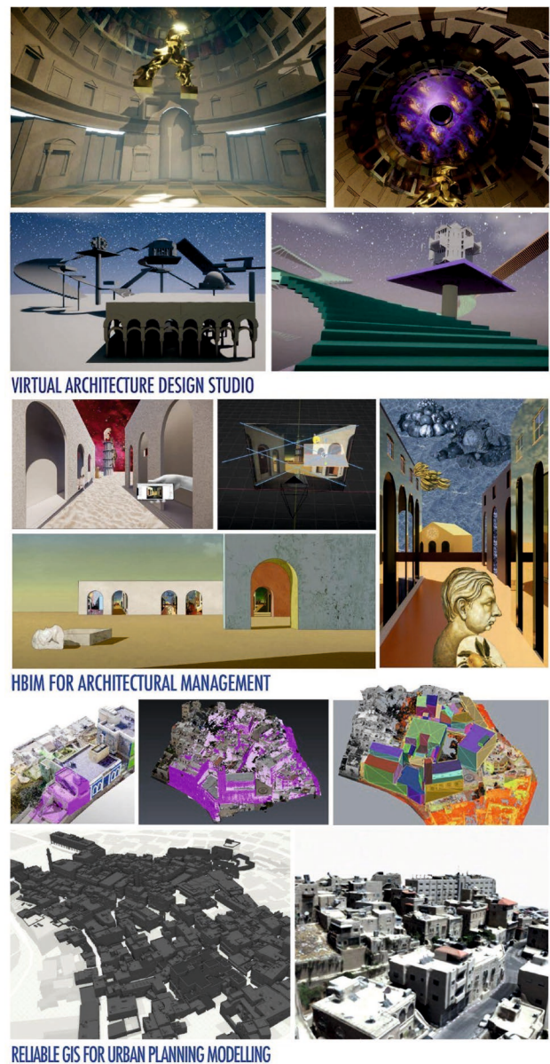
Figure 6. Some of the students' works created during the international workshop

In order to support a preliminary evaluation of the VREA programme, an International Workshop was organised to test a pilot presentation of the programme.(Fig.5) The workshop focused on: (i) drawing youth interest in the integrate programme on Digital management for Architectural Heritage, (ii) recruitment strategy for worldwide students, (iii) mobility network for students and teachers, (iv) appliance of digital tools for didactics and laboratories, (v) open-day and contacts with possible interested Third Parties. The presence of a well-distributed partnership in Europe (Italy, Germany, two Polish universities, one in the North that communicates with the Baltic countries and one in the South that has relations with central Europe) favours the development of cultural exchange, not only of the scientific strengths of each, but also of those of administration and management. In addition to this partnership, there are two non-European countries, Argentina, and Singapore, from targeted regions, which enrich the group by bringing their teaching and exchange experiences and promoting the design idea dissemination even outside the European Union.