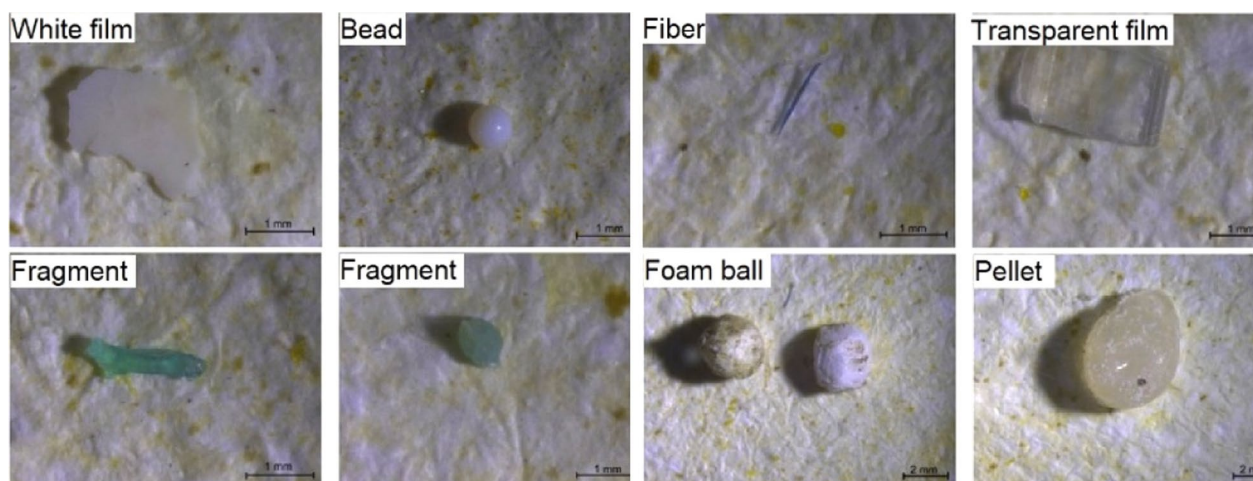
Fig. 1 Main types of MPs present in water. They have hybrid characteristics with different sizes, shapes, abundance, densities, and appearance (From [35] with kind permission of the copyright owner)

chemical processes are involved in advanced oxidation treatment processes while physical separation is the main mechanism in filtration technology. In comparison with membrane filters, rapid sand and continuous backwash filters release more microbeads [34, 35]. Additional file 1: Table S1 depicts the conventional methods for removal of MPs from aqueous media [34]. Some of these conventional techniques are further modified for MPs removal. It is proved that MPs removal can be reached to 88% in the absence of tertiary treatment step and up to 97% with this treatment [36]. By combining various treatment technologies, modern WWTPs can remove significant amounts of MPs (88–99%). However, less than 2% of MPs can still escape from WWTP and reach the aquatic ecosystem, which can be mixed with our drinking water [22]. Moreover, MPs that remain in sludge receive no further treatment and often are directly disposed of on land. The consequences is contamination of soil and groundwater through percolation [37]. In many instances, groundwaters are used for drinking.