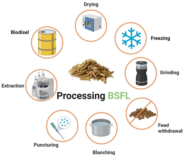
Fig. 3 Applications and technologies in the processing of BSFL (created with Biorender.com)

similar, the digestibility of the protein was significantly higher (exceeding 75%), when the larvae were subjected to oven drying as opposed to microwave drying.