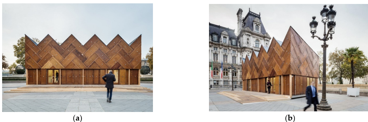
Figure 6. Circular Pavilion, France, by Encore Heureux Architects. Front (a), context of the place (b).

An object with an attractive reuse of woodwork is the Circular Pavilion in Paris (France), designed by Encore Heureux Architects. The historic doors were obtained from nearby Parisian tenement houses (Figure 6). They were used in an unexpected way to create peaks that elegantly and figuratively refer to the context of the place. The solution used in this façade solves the storage problems listed in Table 1, cell 6D.