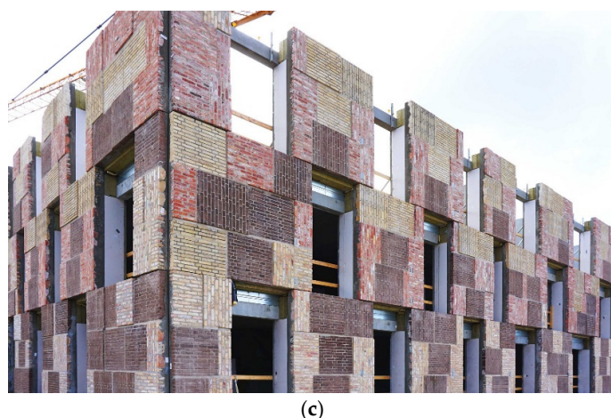
Figure 3. Resource Rows apartment block in Copenhagen, Denmark, by the Lendager Group. Material sourcing at its original location (a), transport of the acquired diamond brick (b), construction process (c). Reprinted with permission from Ref. [37]. 2023, Rasmus Hjortshøj.

Chinese architect Wang Shu, awarded in 2012 by Pritzker, became famous for his designs of buildings in Shanghai, Ningbo, Hangzhou, and Beijing (China), where he poetically uses brick, stone, and tiles [38,39]. The form of the presented Fuyang Cultural Center is very modern, but still pays homage to traditional Chinese architecture. It is not obvious and positively surprising to use tiles as a construction material. Combining them with other elements that are usually treated as worthless building rubble produces a mosaic showing the history of the place (Figure 4). The presented example shows the versatility of tiles (see Table 1, cell 8D), which are used to build the roof and structural-façade walls (Figure 4). The critically acclaimed Wang Shu outlines an important direction of development and a goal that contemporary architecture should pursue, which is to increase the architectural value of reused materials.