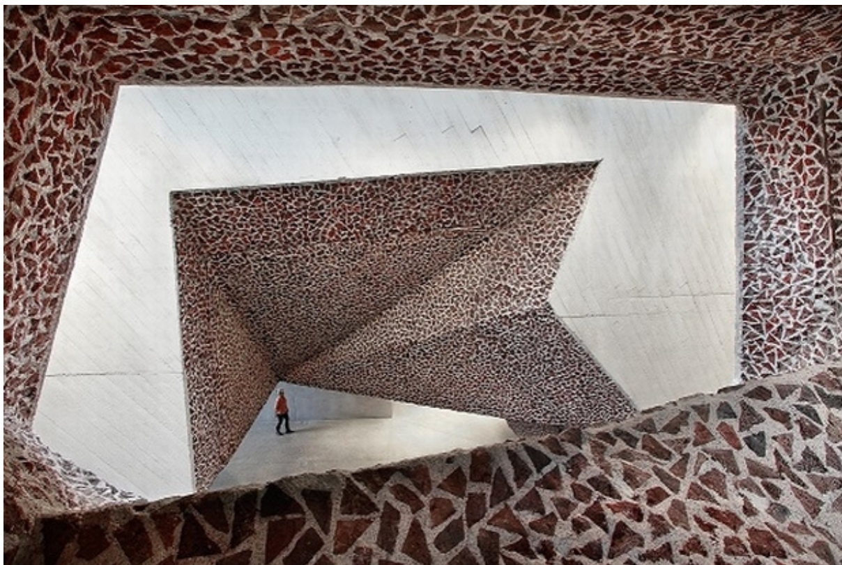
Figure 8. Jordanki Cultural and Congress Centre in Toruń, Poland, by Menis Arquitectos. Broken demolition brick sunken in cement.

In the case of the Jordanki Cultural and Congress Centre in Toruń, specially prepared brick rubble is exposed on fragments of the façade from under the ‘skin’ of the concrete (Figure 8), allowing us to discover the Gothic pedigree of the city [64].