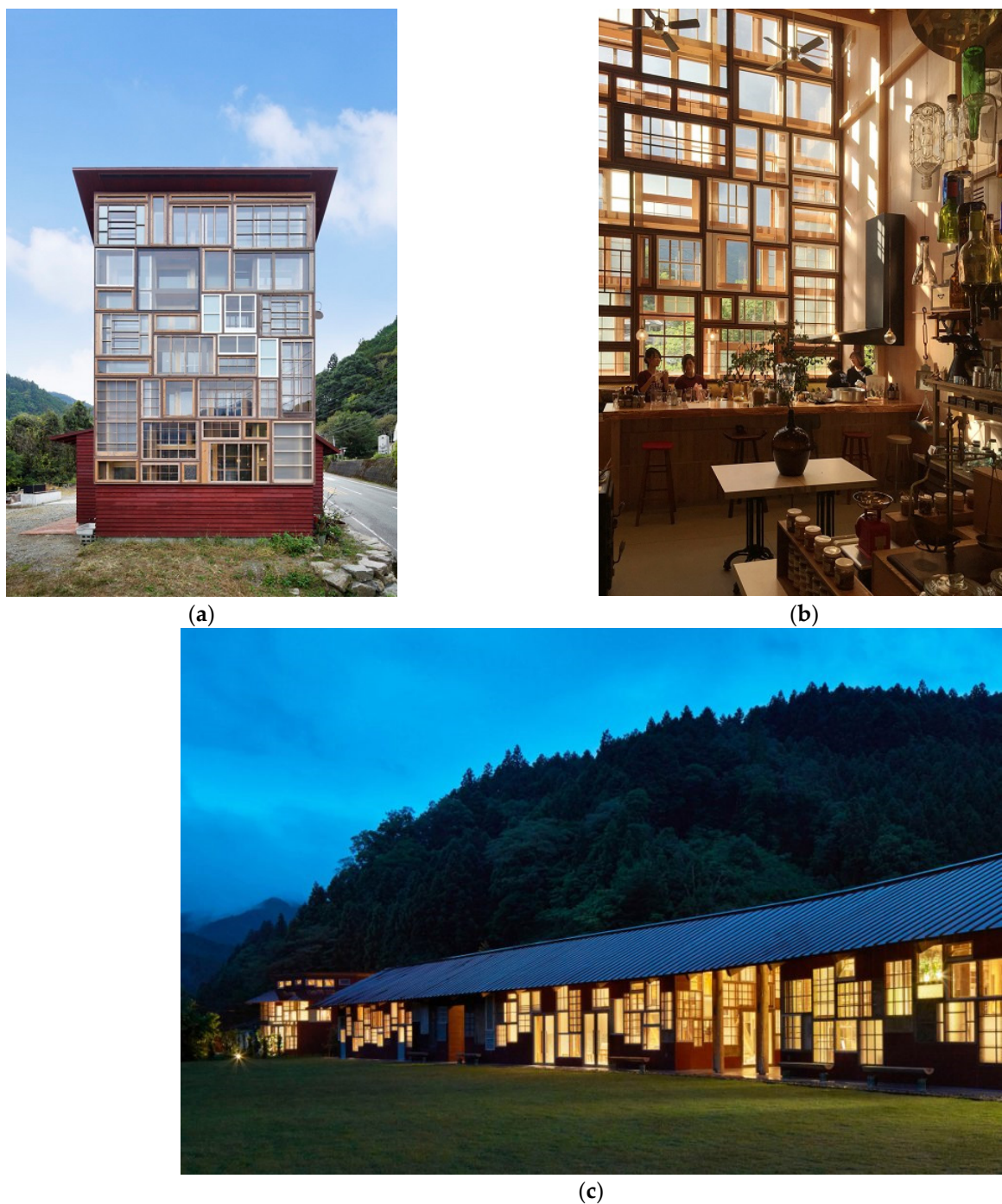
Figure 7. Restaurant and Zero Waste Center in Kamikatsu, Japan, by Hiroshi Nakamura and NAP. Façade (a), interior (b), window layout (c). Reprinted with permission from Ref. [43]. 2023, Koji Fujii/TOREAL.

The presented examples have been selected in the order given in Table 1 and testify to the wide possibilities of reusing building materials. They can be used both as structural elements of walls—House in Rudy [36], Fuyang Center [40]; roofs—Museum in Gdańsk [41]; but also as a façade—Resource Rows [37], Circular Pavilion [42], Kamikatsu Center [43]. They come from all over the world and represent the highest level of architecture. The intention in showing them was a paradigm shift—recycling does not always have to be associated with the ‘junk’ quality of design. It can represent a new direction, a challenge for