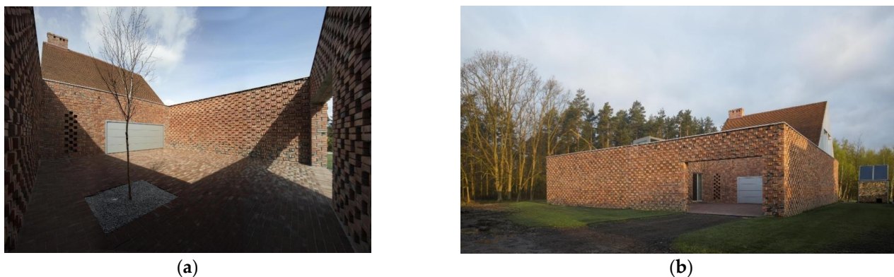
Figure 2. Single-family house in Rudy, Poland, by Toprojekt Architect Studio. Inner courtyard (a) and fence (b). Reprinted with permission from Ref. [36]. 2023, Karol Wawrzyniak.

Figure 2 shows an example of the use of demolition brick. It comes from the demolition of the buildings of the local mine in Ruda Śląska (Poland) and was used to build a single-family house according to the design of Toprojekt Architect Studio. The photos show the versatility of this material, used both in structural walls, in flooring (Figure 2a), and in a fence (Figure 2b).