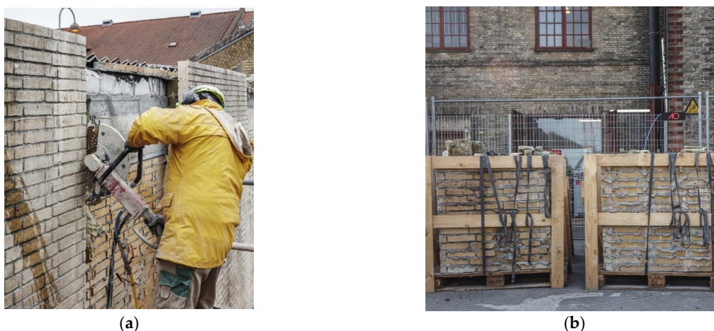
Figure 3. Cont.

A material with similar qualities is diamond brick, which can also be a distinctive element of a building's architecture. The ability to vary the direction of the brick arrangement produces unexpected visual effects (Figure 3). Diamond brick can also be used to lay paths, emphasising the versatility of the material used, or provide a uniform style to a building. An example of the use of diamond brick comes from Denmark, where the Lendager Group studio designed the Resource Rows apartment block in Orestad, which was nominated for the Mies van der Rohe award. The innovative nature of this project results from the creatively used variety of colours of bricks. The material comes from the dismantling of historical buildings of Copenhagen breweries, schools, and factories. Square segments of the walls, together with the mortar, were cut out as single units and transported on pallets (Figure 3). This form of obtaining and transporting material increases the investment costs, but the architectural benefits outweigh this (see Table 1, cell 3C). The presented implementation shows that reused material can be an important part of the chain in a circular economy. The object in question was the first motivator to work on this article.