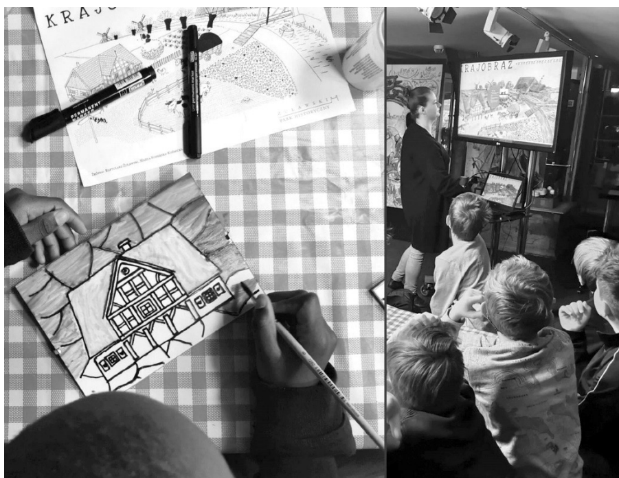
Fig. 2. Use of Raptularz... by external institutions (Żuławy Historical Park).

houses, technical monuments, or elements of interior design). A part of the booklet is devoted to non-material heritage: old crafts, regional cuisine or clothing. The publication was distributed free of charge to local libraries and institutions, and this fairly widespread availability meant that it was used to promote the region in classes by external institutions, including the Żuławy Historical Park, as well as by primary school teachers, who, use it most often in grades 1–3, due to its simplified form (Fig. 2).