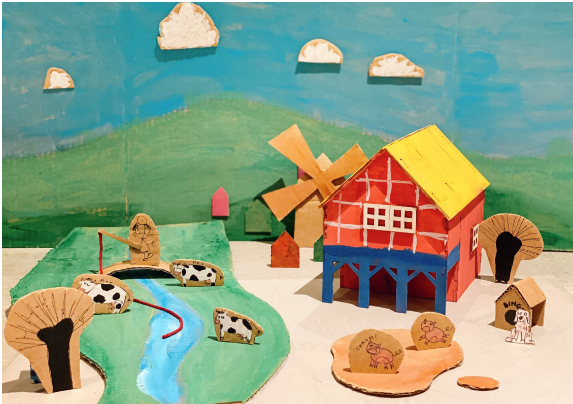
Fig. 5. Additional landscape elements in the work created during online workshops.

Thus, Komorowska's observations that issues related to landscape and regionalism constitute a small part in relation to the whole range of content taught in primary school (Komorowska, 2008) seem to be still valid, but as the analysis of the conducted informal activities showed – there is a possibility to expand in the field of cultural landscape education during other, additional classes.