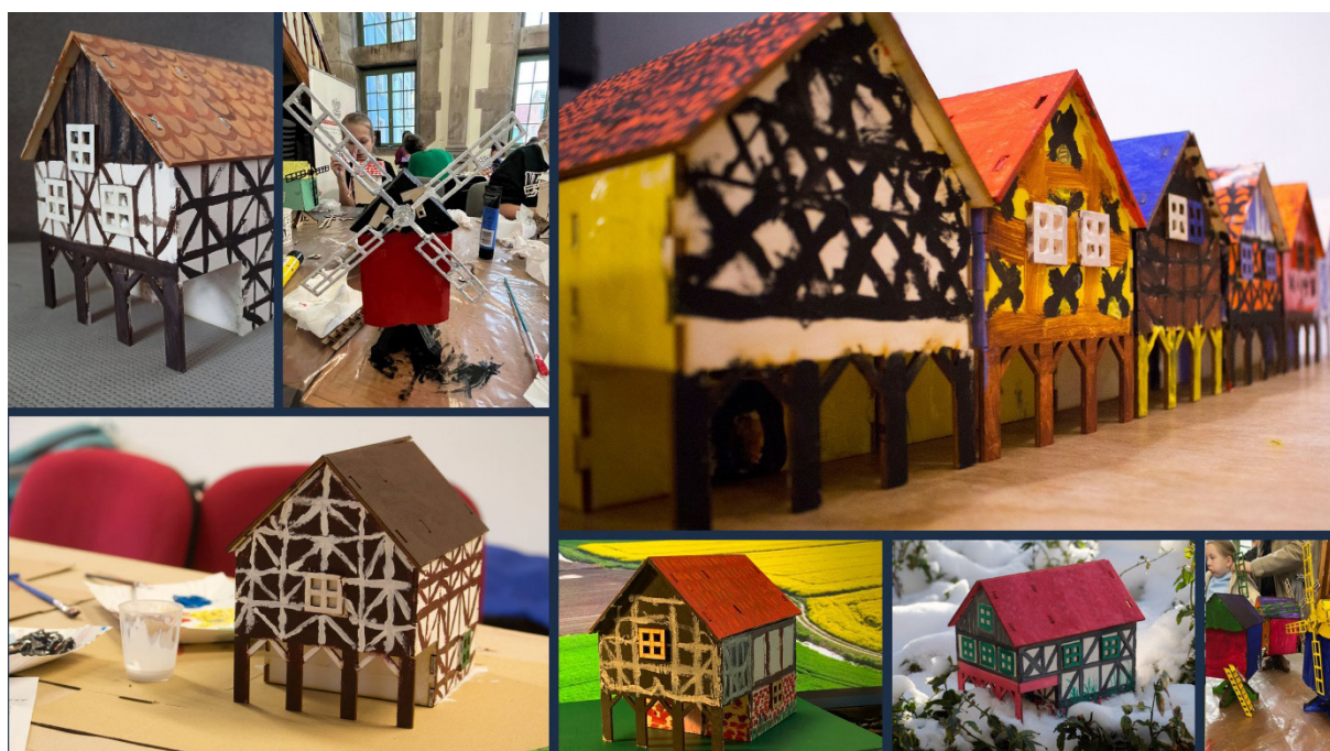
Fig. 4. Final results of the workshops.