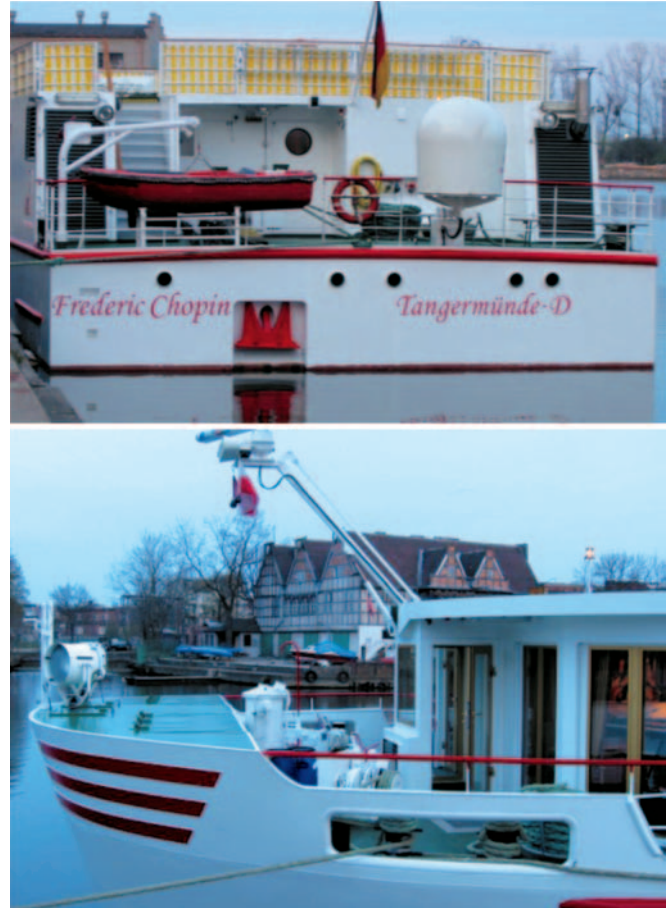
Fig.1. Anchoring and mooring equipment arranged in the bow and stern part of the tourist ship „Frederic Chopin” .