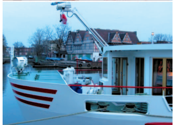
Fig.1. Anchoring and mooring equipment arranged in the bow and stern part of the tourist ship „Frederic Chopin” .