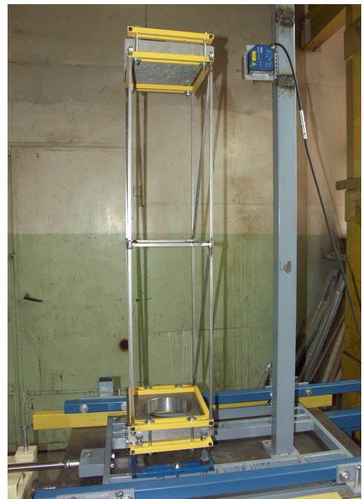
Fig. 1 Setup of the experiment.

A small shaking table was used in the experimental study focused on the effectiveness of the polymer bearings. It is a unidirectional device with the platform dimensions of 0.75×0.6 m excited by the linear actuator PARKER ET50 with the stroke of 0.5 m and maximum acceleration of 10 m/s 2 . A 1 m high model tower was built to be tested during the experiment. It was constructed from four steel columns of the rectangular cross section of 8×8 mm with the mid-height horizontal connections and