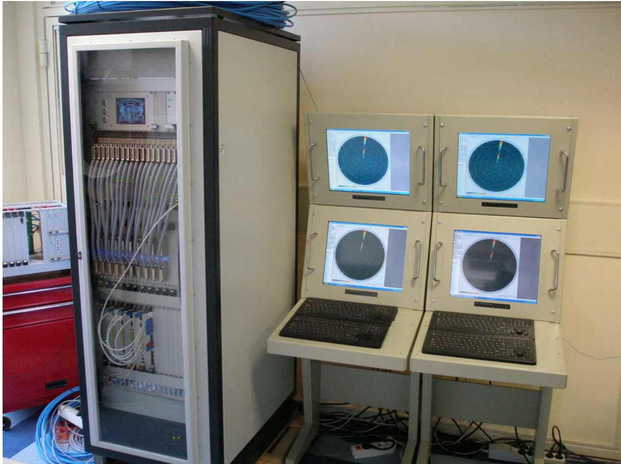
Fig.2. The Digital Signal Processing Unit and Operator Consoles of the modernized ASW sonar SQS-56 during the laboratory testing