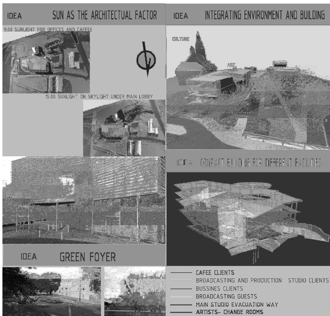
Fig. 3 Analysis of possible infill development urban scenario