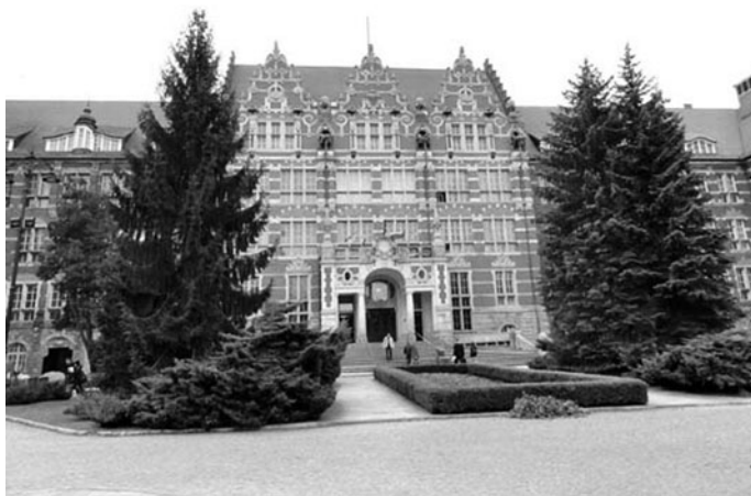
Fig. 17. The Main Building of the Technical University of Gdańsk ( Politechnika Gdańska).