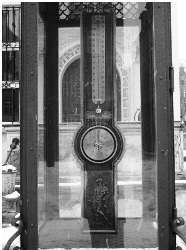
Fig. 4. The Fahrenheit monument, meteorological station.

Fahrenheit also discovered and measured the changes in the freezing and boiling points of water with atmospheric pressure. Further, he invented the cascade method of cooling, and hence may be regarded as a pioneer of cryogenics, having reached a record low temperature of 40 degrees below zero (which is identical on both the Fahrenheit and Celsius scales) in 1730. The Fahrenheit monument in the Long Market is unique: it has the shape of a meteorological station with an enlarged copy of a lost 1752 Gdańsk thermometer connected to an aneroid barometer—one of the first in the world. The temperature can be read in both Fahrenheit and Celsius degrees, and the pressure in millimeters of mercury and—as a modern addition—in hectopascals. A memorial plaque to Fahrenheit is on the rebuilt façade of his birthplace, some 100 meters up the neighboring street, at 95 Ogarna (Hound) Street.