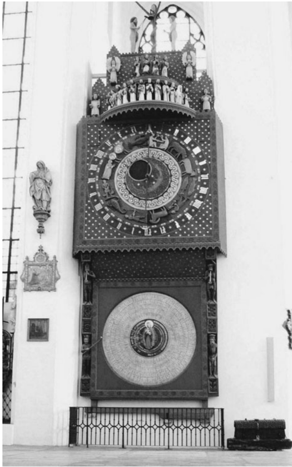
Fig. 11. The Astronomical Clock of 1470 in St. Mary's Church.

The ingenious system to indicate the phases of the Moon consists of an external dial that moves together with the Sun's plate once around the Zodiac in one tropical year, and an internal dial that is connected to the Moon's plate, which makes one complete revolution in one sidereal month. The internal dial is divided into two fields, black and golden, while the external dial has an oval opening through which part of the surface of the internal dial can be seen. Their combined movements change the proportions of the black and golden fields of the internal dial in the oval opening of the external dial with a periodicity of one synodic month. At New Moon, the field in the oval opening is black; at Full Moon, a serene