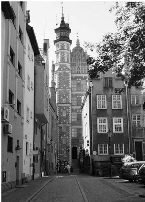
Fig. 9. The Naturalists House, today the Archeological Museum.