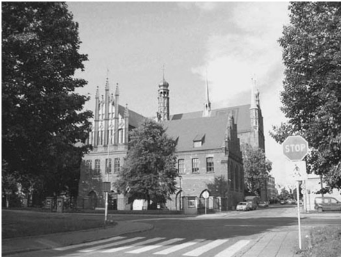
Fig. 15. The former Academic Gymnasium , today the National Museum.

We next visit the ancient Franciscan monastery, which today houses the National Museum (figure 15) located on Toruńska Street in the Old Suburb. After the Reformation, the monks who had built the monastery in the 15 th century were compelled to transfer it to the City Council, who first converted it into a secondary school and then, in 1580, into the Academic Gymnasium . In 1596 the famous Gdańsk Library was added—which now belongs to the Polish Academy of Science and is in a newer building in Watowa (Wall) Street. Many famous scientists taught or studied in the Academic Gymnasium , the most universal one being Bartholomeus Keckermann (1572–1609), who lectured and published on logic, mathematics, geometry, optics, astronomy, geography, ethics, politics, economics, philosophy, metaphysics, rhetoric, and physics. His Systema physicum , published in Gdańsk in 1610, went through several editions, including foreign ones. His colleague, the astronomer and mathematician Peter Krüger (1580–1639), was the first to formulate the law of cosines and to elaborate logarithmic tables in which the logarithms of trigonometric functions were separated from those of numbers. 17 The geographer Philip Clüver (1580–1622), who later became a professor in Leiden and founded the field of historical geography, set the eastern border of Europe as the Ural river. Heinrich Kühn (1690–1769) created a prototype of