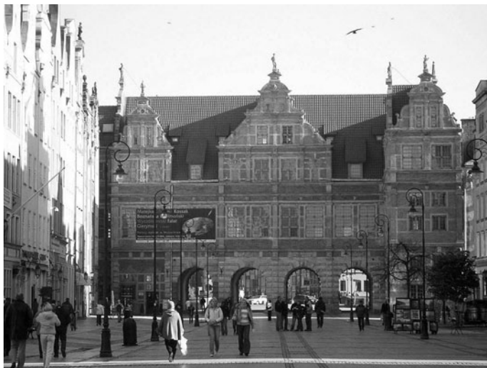
Fig. 5. The Green Gate, the former seat of the Societas Physicae Experimentalis .