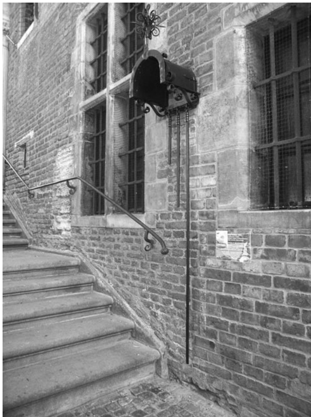
Fig. 2. The historical standards of length of Gdańsk.

rotating drum that was set in motion by the tower clock mechanism each hour on the hour. As the drum revolved, the pins raised the bell hammers by means of bars and wires, and when they dropped the bells played in a preset sequence. The tunes they played were recorded in the tower books by indicating the positions of the pins on the drum. I and a group of musicians from the Gdańsk Academy of Music managed to decipher them, so we now can listen to the old tunes played on the new bells, which are recorded on chips that control the electromagnetically driven hammers. The tunes are changed every week. There also is a special counter, with a manual and pedal that carillon virtuosi use to give regularly scheduled concerts.