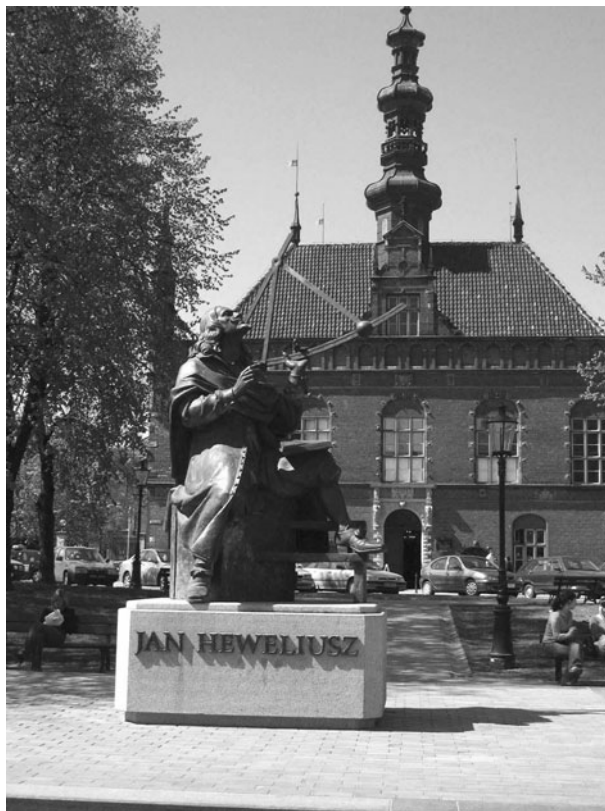
Fig. 14. The monument to Johannes Hevelius (1611–1687).

Hevelius also continued to measure the magnetic declination in Gdańsk and discovered its secular changes. Another Polish King, Jan II Kazimierz (1609–1672), rightly claimed that Hevelius “will be the ornament and pride of Gdańsk in the centuries to come,” 16 as future generations confirmed. They erected an impressive monument to Hevelius in front of the Town Hall in the Old Town (figure 14). The Town Hall, built by Anthoni van Obberghen (1543–1611) in 1594 and not destroyed in the last war is very worthwhile visiting. In its two-story cellars Hevelius used to store his beer. In the large Hall on the upper floor he attended assemblies and sessions of the court.