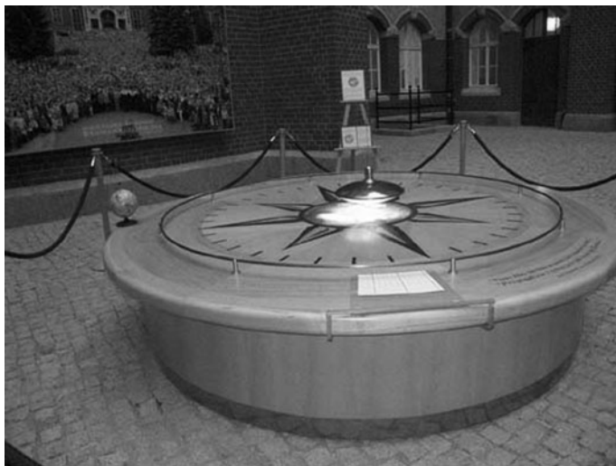
Fig. 18. The Foucault pendulum.

In addition to these universities, a visit to the Cathedral with its famous organ, one of the largest in Poland, is very worthwhile. The Cathedral is also located in Oliwa and formerly was the Cistercian Abbey, founded in 1186, where the monks had a printing shop in which scientific books and papers also were printed. These included the world's first account of the supercooling of liquid, which the Gdańsk physician Israel Conrad (1634–1715) observed in 1670, and the less-serious Physica Curiosa that the Jesuit Adalbert Tylkowski (his exact birth and death years are unknown) edited in 1680 as Part VI of the Philosophia curiosa , which attracted great interest in Europe. The Abbey's magnificent park and its surrounding wooded hills and valleys abound in enchanting sights. Also worthwhile is a visit to the Zoological Garden, the largest one in Poland, which is also located in this enchanting district of Gdańsk.