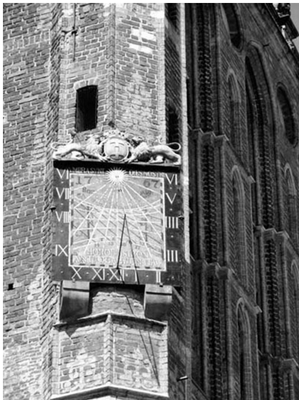
Fig. 3. The solar dial of 1588.

(figure 4) to the famous physicist Daniel Gabriel Fahrenheit (1686–1736), 4 who was born in Gdańsk but spent most of his life and died in Holland, nevertheless always maintaining a connection to his native town. His greatest achievement was the construction of the first reliable thermometers, filled with quicksilver (mercury) and based upon two fixed points, the freezing and boiling points of water. He was elected as a Foreign Member of the Royal Society of London in 1724; his mastery had been extolled at its meeting on March 5, 1723: