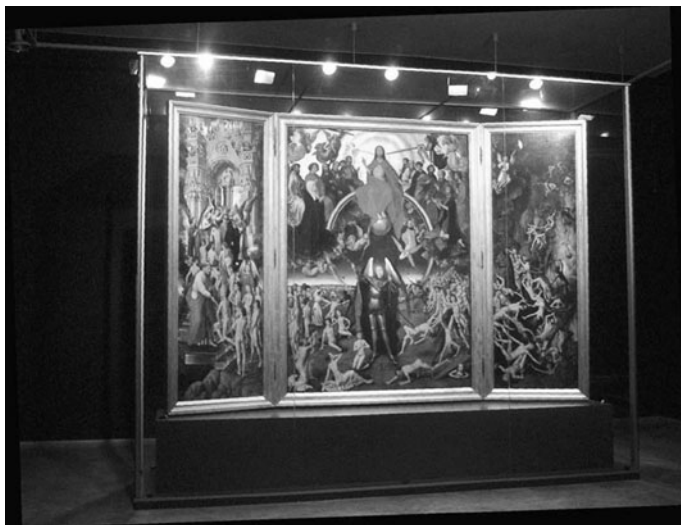
Fig. 16. The Last Judgement by Hans Memling (ca. 1430-1494).