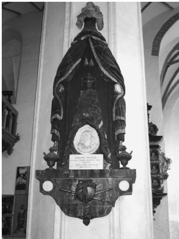
Fig. 13. The epitaph of Johannes Hevelius (1611–1687) in St. Catherine's Church.

settings. He also invented the periscope, which he called a polemoscope . Under his guidance, the clockmaker Wolfgang Günther ( ca. 1610–1659) constructed the first pendulum clocks at the same time as did his famous Dutch contemporary Christian Huygens (1629–1695).