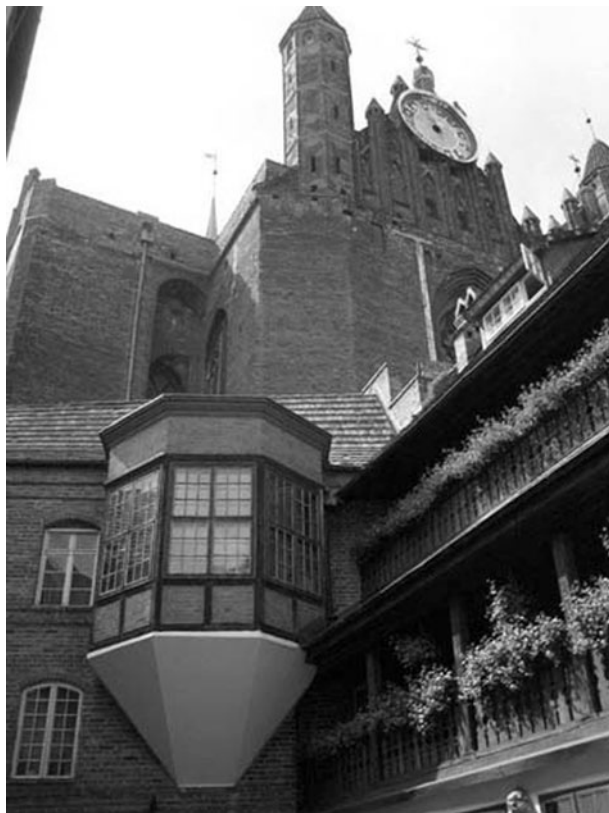
Fig. 10. The courtyard of the Old Vicarage.