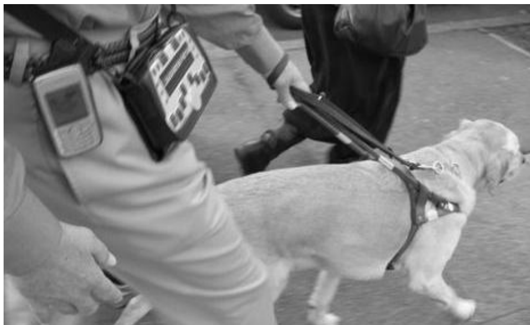
Fig.1. Sendero GPS in action.

There are more systems for the blind, for example Loadstone GPS [3] or polish Navigator [4], but their capabilities are even lower, as they use sets of points instead of full maps.