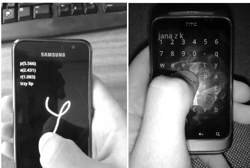
Fig.6. Sample text input method: based on gesture recognition (on the left) and letter choosing (on the right).