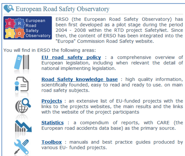
Fig. 2. Homepage of European Road Safety Observatory [4]

Tasks and objectives of the currently operating observatories of road safety in the world depend on the level of their activities: European, national or regional, however the common features between these institutions can be distinguished. Road safety