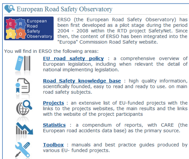
Fig. 2. Homepage of European Road Safety Observatory [4]

Tasks and objectives of the currently operating observatories of road safety in the world depend on the level of their activities: European, national or regional, however the common features between these institutions can be distinguished. Road safety