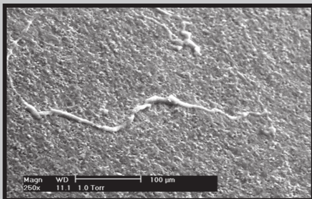
FIG.2. The view of the surface (250x)