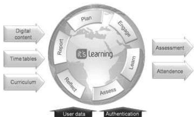
Fig. 1. Itslearning functionalities [14]

The basic LMS e-tool used in RM is an educational platform Itslearning . It is one of the globally applied learning platforms designed for the education sector. It is used in both universities and high- or primary- schools. Itslearning is easy to use and is supported by popular web browsers. The platform ensures confidentiality requirements of participants' personal data. Messages are delivered to each student individually, although some Assignments take place in groups. Figure 1 illustrates functionalities of Itslearning .