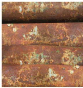
Uniform corrosion [2]