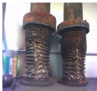
Expansion joints on a steam line that have been destroyed by water hammer [7]