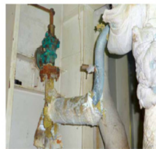
Temporary wooden plug in steam line [2]