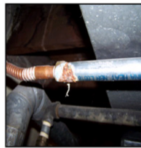
Electrochemical corrosion [5]