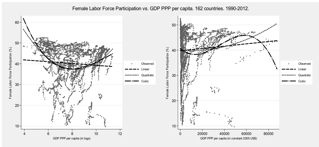
Chart 1. Female Labor Force versus GDP per capita. 162 countries. Period 1990-2012.

bor market remains significantly low, regardless of high GDP per capita. It leads to the general conclusion that changes in female labor force participation are not exclusively attributed by economic growth, but depend on a multitude of factors which are not captured in here.