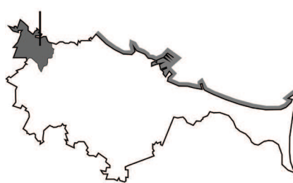
Slika 1: a) Shematska karta Poljske; b) Shema mesta Gdańsk (ilustraciji: Weronika Dettlaff). Figure 1: a) Schematic map of Poland; b) Schematic map of Gdańsk (illustrations: Weronika Dettlaff).