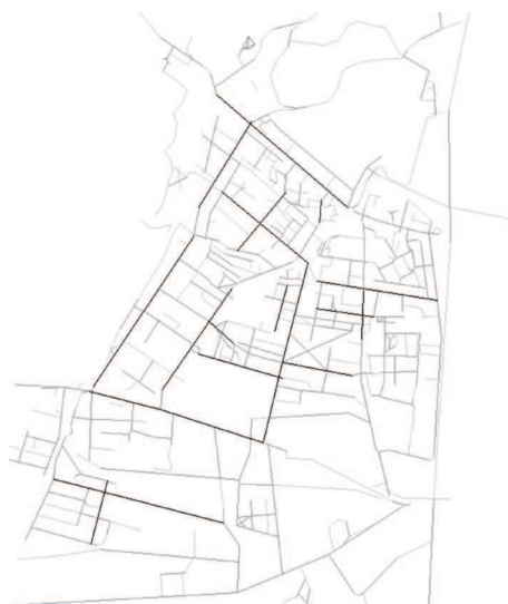
Figure 4: (Right) The extracted open spaces that seem to be the most significant ones for the development of the community in Gdansk Osowa (illustration: Weronika Dettlaff).

Slika 4: (Desno) Izbrani so prostori, ki so najbolj pomembni za razvoj skupnosti gdaškega mestnega območja Osowe. (ilustracija: Weronika Dettlaff).