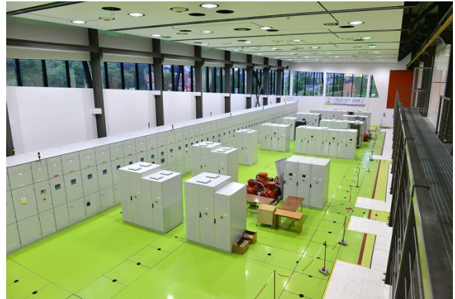
The main room of the LINTE 2 lab