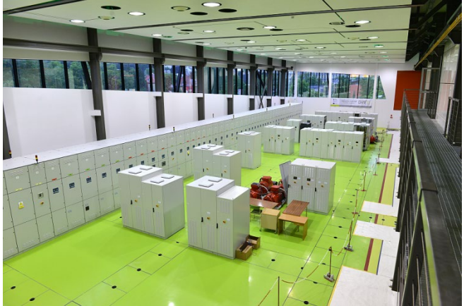
The main room of the LINTE 2 lab