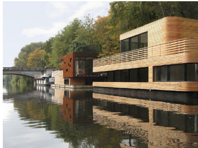
Phot. 2. Water homes in Eibekkanaal, Hamburg.

Hamburg is a forerunner in the area of housing on water in Germany. In 2006, city authorities issued a permit for the mooring of floating houses on local rivers and canals. Architects were given permission to design innovative solutions, without limitations in design or materials. One of the first water settlements, located in Eibekkanal, Hamburg and shown in Photograph 2, consists of ten units. The reason for the interest in floating houses is the desire to own a home near the center, high land prices, and the increasing population density in Hamburg (www.ndtv.com). Most of the houses are privately owned vessels. Although the purchase or construction of such units is more expensive than that of a traditional home, the lease of the bottom surface occupied by a vessel is much lower than the purchase or lease of land on shore at the same distance from the city center.