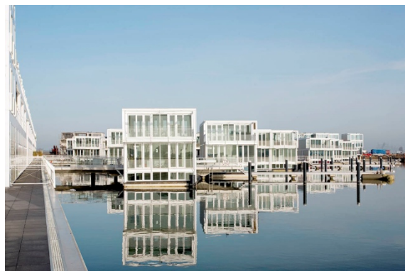
Phot. 1. A settlement of floating homes in IJburg, Amsterdam.

The Netherlands is a leader in housing on water in Europe. There are two main justifications of such interest in floating residential units. Firstly, the Netherlands belongs to the group of the most densely populated countries. Secondly, there is the fact that about 60% of its surface is below the sea level. For hundreds of years, the population of the Netherlands has been battling with the elements, while being exposed to continuously rising sea levels, which are the result of the greenhouse effect. Originally, the process was aimed at draining more areas and obtaining building land from the sea, but environmental, technological and economic changes resulted in a change of government policy. The country began to support construction activities on water, building housing estate vessels (residential barges or buildings constructed on floating platforms); it adapted laws and put new office holders into power. One of the most popular and prestigious floating estates in the Netherlands is Waterbuurt. It is located in Amsterdam and is a part of the district of IJburg; the residential settlement includes 75 (or, according to the Financial Times, as many as 93) floating homes moored to jetties as shown in Photograph 1.