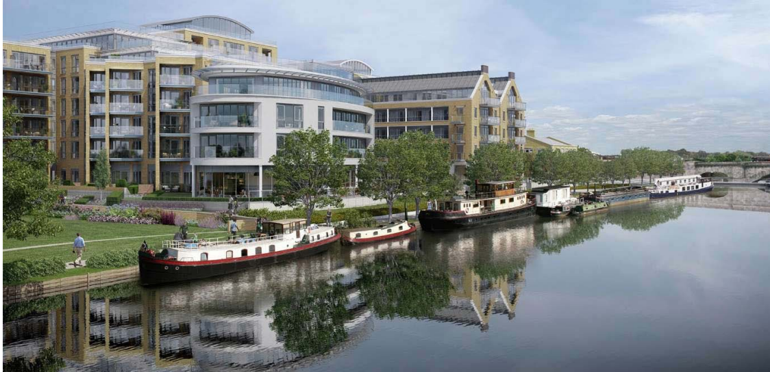
Fig. 1. Narrowboats moored next to Kew Bridge in London.

In the cities, most narrowboats are moored along quays of canals and rivers which can be seen in Figure 1. The main determinants of this form of settlement on water bodies in England are sailing conditions, and the widths of the rivers and canals. In the towns and villages, one can find small and medium-sized harbors where owners of these units are gathered.