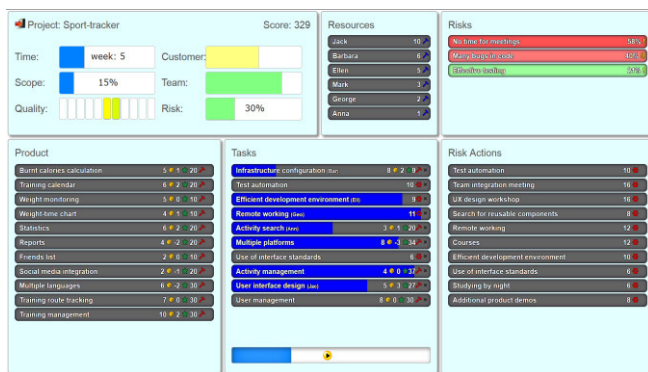
Fig. 1 The GraPM game user interface mid-game

The GraPM game was implemented within an engineering diploma project in 2014 [19]. It is a JavaScript-based rich internet application run in a web browser, see Fig. 1.