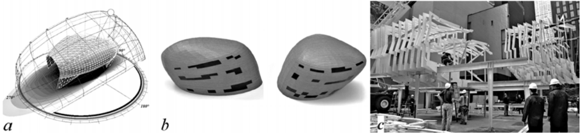
Fig. 3. (a) solar analysis, (b) envelope optimization, (c) structure assembly.

Elaborated by means of parametric modelling tools System BURST*008, similarly uses only passive means to optimize micro-climate inside the house. Due to the sophisticated accordion like construction the shape of each instance of a house could be conform to specific constrains based on environment (wind and humidity), site or orientation. “The flexibility of BURST comes from literally weaving two sections together – the natural ground plane and artificial, manipulated plane. The two planes travel vertically and horizontally to compromise the ground, the floor and the walls. The weave can open, close or reshape in order to let in or keep out warming sun and cooling breezes.” [2]