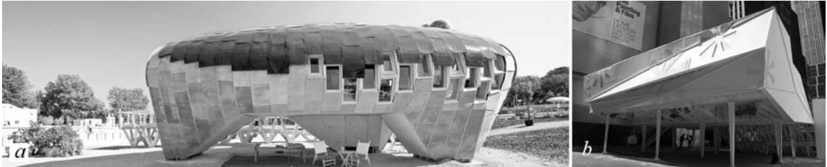
Fig. 2. (a) The Solar House, IAAC, 2012; (b) System BURST*008, Gauthier D., J. Edmiston, 2008.

The form of The Solar House also results from parametric design strategy in which “form follows energy”. The shape of the house resembles a three legged headless body of an animal covered with scales made of solar panels. (Fig. 2a) [10]