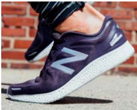
Fig. 2. Midsole printed by New Balance (3D SLS technology) [ https://www.newbalance.com/article?id=4041 ]

Rys. 2. Podeszwa wydrukowana przez firmę New Balance (technologia 3D SLS) [ https://www.newbalance.com/article?id=4041 ]