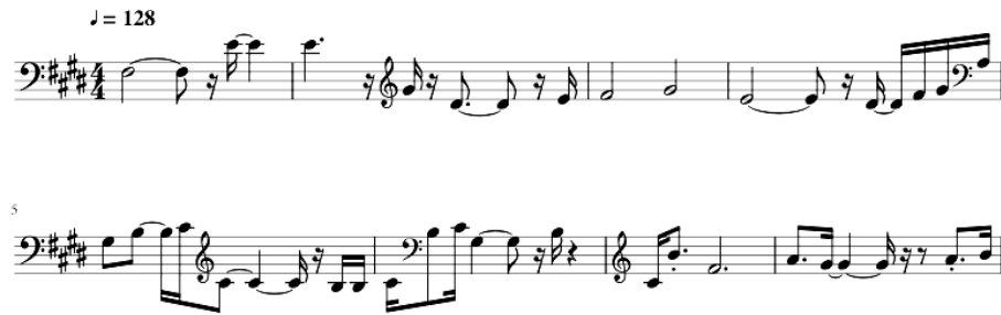
Fig. 5. Lowest rated melody generated using Music Composer