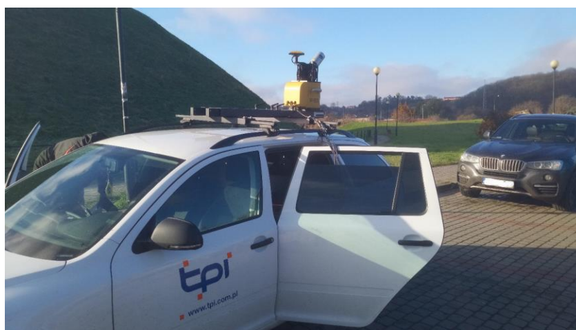
Fig. 2 Mobile laser scanner (Topcon, IP-53)

In architectural inventory, Mobile laser scanning (MLS) has its usefulness when the project requires spatial information about complex of buildings with the high accuracy of the data and where the user is able to save a lot of time in comparison with measuring the whole structure by using the terrestrial laser scanning. Mobile scanner bases its operation on the trajectory. It is referred to as the path of the object's motion in a function of time and it is the starting material for the integrated system of IMU / GNSS (Inertial Measurement Unit / Navigate Global Satellite System), also called as INS (Inertial Navigation System). INS determines speed, position and angle orientation of the unit. Angle orientation is determined by the three- axes gyroscopes and accelerometers described as the values of the angles: roll (transverse swinging), pitch (longitudinal swinging) and yaw (angle, corresponding to the device descent of the course). To set an approximate position of the scanner the GNSS unit is used and it refers to information about XYZ coordinates of the scanner. They are important for the correct execution of coordinate transformations registered by the scanner into the coordinates recorded by the GNSS receiver. In order to transform the coordinates correctly, it is required to measure the distance between the point 0.0 of the receiver (the phase center) and point 0.0 of the scanner (the origin of the scanner) (Janowski et al., 2015).