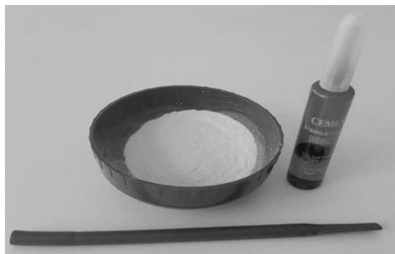
Fig. 1. Components of bone cement and instruments for its preparation

Bone cement is a biomaterial used in medicine to fix implants, fill bone defects and stabilize fractures. It is a special self-polymerizing mass - obtained by mixing two components (Fig. 1): liquid and powder (i.e. a polymer with a monomer) and initiating the radical polymerization process. As a result, the bone cement obtains a porous structure composed of mutually tangled chains [1-3]. After the polymerization process and planting in the body, the bone cement mass is curing and fulfills a certain function. The bone cement powder has the form of regular beads or irregular particles of micrometric size. It contains the component initiating the polymerization reaction, while the inhibitor is contained in the liquid [3,4]. There are various types of bone cement, the most popular include: polymeric, phosphate-calcium, hydrogel, composite, bioactive acrylics [5,6].