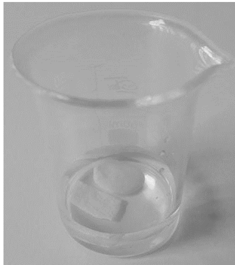
Fig. 3. Sample of bone cement immersed of SBF solution

the so-called SBF (simulated body fluid) are Ringer's fluid and Hank's fluid with an ionic composition similar to human blood plasma and Ph 7,4. The test involves placing the specimen in solution at 37 °C for 4 weeks. The structure of the bone cement is then analyzed using microscopy, e.g. SEM (Fig. 4)