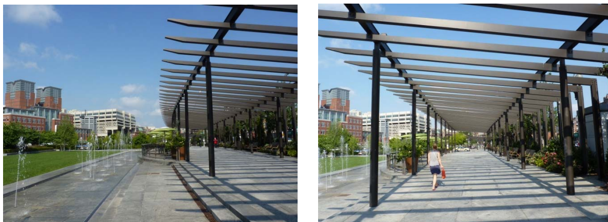
Figure 1. North End Parks, part of the Rose Kennedy Greenway – a “front porch” and pergola, serving as a spatial extension of the lively streets

As stated in a study under the title Greenway District Planning Study: Use and Development Guidelines , prepared by the Boston Planning & Development Agency, formerly known as the Boston Redevelopment Authority: “The Greenway is the result of a dramatic transformation of a transportation corridor into a major urban park and civic asset. This transformation has created the potential to exponentially increase the local and regional value” [11]. The role of the park is to stitch together old neighbourhoods and to create connections between previously remote districts [11].