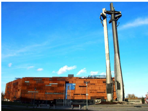
Figure 5. European Solidarity Centre is reminiscent of the hull of a ship. Three Crosses Monument, the symbol of the the Solidarity Movement is at the front of building.

Another cultural building is the European Solidarity Centre (ECS) opened in 2014. 1 It is situated in Śródmieście district, within the territory of the Young City, at Solidarity Square, in the vicinity of Gate No. 2 and the Three Crosses Monument - places related to the Solidarity Movement. The building houses permanent exhibition which in an interactive manner recounts the story of the Shipyard trade union - a movement which played the key role in the process of defeating communism in Poland and later in other Eastern European countries. Figure.5