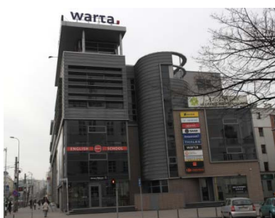
Figure 7. Office building, Gdynia, Władysława IV street, Poland