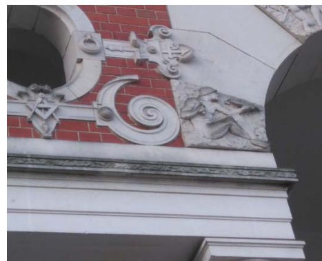
Figure 2. The man holding model of ships as a decoration above the side entrance to the building of the Gdansk University of Technology, Poland

Designing a building is a creative process requiring the designer to express his / her thoughts through an idea. This does not mean that an idea contained within an object must be complicated or sublime. A simple concept is very often sufficient to support an entire design and infuse it with expression that will evoke positive emotions in viewers [2].