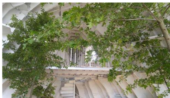
Figure 17 (a) (b). Spatial installation in front of the Contemporary Art Museum, Seoul, Korea [9]

The Contemporary Art Museum in Seoul has given young designers a chance to present their creative and innovative work. In front of the Museum, there was a spatial installation made from parts of the ship extracted from the seabed. The inside of the freshly-welded, capsized, white-painted hull was hiding a small garden (Figure 17 a, b).