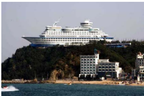
Figure 15. Sun Cruise Hotel, Jeongdongjin, Korea [7]