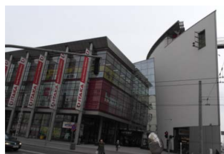
Figure 8. Batory Shopping Centre, Gdynia, 10-go Lutego street, Poland

Present-day architects take a dim view of ornamental overkill in their designs, and even speak about its dangers [6]. However, the popular tendency to decorate buildings has remained, with naval references appearing, to a larger or lesser extent, in the outer form of buildings.