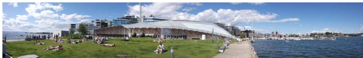
Figure 12. Contemporary Art Museum, Oslo, Norway.

Contemporary Art Museum in Oslo designed by an Italian architect Renzo Piano utilizes the location and its components to build up a local context to lend the building a form consistent with the buildings nearby. The sail-shaped roof stretches over two wings of the museum building, welding them together, alluding to its location by the water (Figure 12).