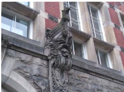
Figure 1. The bow of a ship placed as a decoration above the side entrance to the building of the Gdansk University of Technology, Poland

Inspiration is a phenomenon inextricably connected with creative thinking. Inspiration is tapped by creators who need something new to reflect upon, something to fuel their creative process. Inspiration is not defined in its role as a factor stimulating the creative process. Inspiration may be found in different places by each artist, e.g. in nature, an impressive object, a situation in which they find themselves or an experience brought to them by a book they once read. For an artist who needs it, inspiration is a look-and-find activity in search for novelty, serving as a leitmotif and a template for creative solutions.