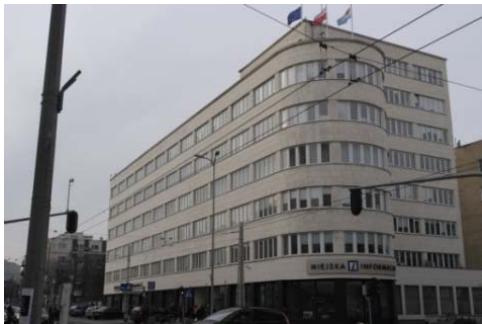
Figure 3. The City Hall building (originally the headquarters of the Social Insurance Company, then the seat of the Polish Ocean Lines, Gdynia, 10-ego Lutego street, Poland

“When a building expresses another building or when specific architectural elements serve as quotations of other places and structures, this is what we call architecture within architecture” [4]. The reinterpretation of existing buildings or structures in contemporary constructions enriches architecture. This relates to transposing elements of a building onto a different architectural structure. But this may also refer to transposing elements typical of ships onto civil engineering objects. Subtle, discreet references may become a hallmark of architectural or spatial planning projects. This is exemplified by Gdynia which is known as the most maritime of all Polish cities. This relatively young city uses the following words for its motto: “A city of the sea and dreams.” The spatial planning scheme came into being simultaneously with the erection of the harbour, whereby the city and harbour composed to form a whole [5].