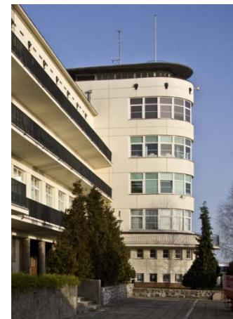
Figure 5. Polish Seafarer’s Home (now, the Department of Navigation of the Maritime Academy), Gdynia, Jana Pawła II street, Poland

The street grid in the city centre with its uniform architectural design was to make Gdynia into a showpiece of Poland as a maritime country. This was demonstrated in the use of uniform architectural details inspired by naval architecture. These include rounded corners reminiscent of hulls, round windows modelled on portholes, protruding parts resembling bridges, masts, as well as bright colours. The buildings in the centre of Gdynia, which appeared in the 1920s/1930s, earned the label of “white architecture” and made the city famous for its architectural design. Its style is described as “Gdynia modernism” (Figure 3, 4, 5).