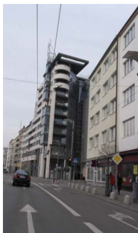
Figure 6. Residential building, Gdynia, Derdowskiego street, Poland

Gdynia's buildings, those of modernist style and recent origin, exemplify subtle attempts to reinterpret the ship form and shape the viewer's perception in a positive way.