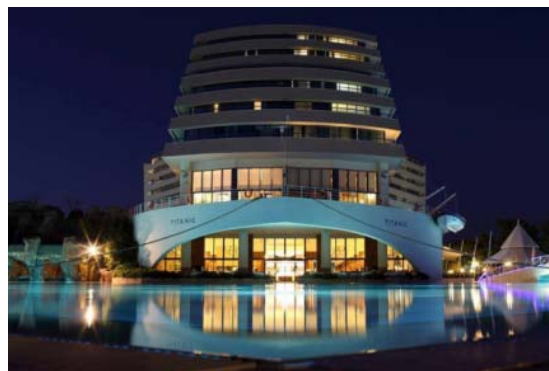
Figure 16. Titanic Hotel, Antalya, Turkey [8]

The above examples show that inspiration does not always drive creativity. This is connected with a lack of understanding for the phenomenon of inspiration which is short-lived. As a result, buildings come into being, whose form is the effect of a creative reworking of inspiration. These can be classified not only in terms of transcending the bounds of inspiration but also as an overinterpretation of the ship form.