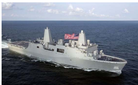
Figure 18. USS New York LPD-21 [10]

The concept of recycling has made it possible to use the remnants of the World Trade Centre towers that were destroyed in the terrorist attack of 2001. The steel from both buildings was melted down and reused in a surprising form. The steel was used to build a naval vessel. The symbolic strength of the ship was aimed to overcome the traumas associated with the assassination. In this case, the ship is not an inspiration for a land object, because the elements of the building were used to build the ship (Figure 18).