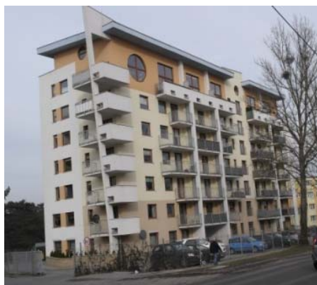
Figure 9. Apartment building, Gdynia, Chwarznieńska street, Poland

Present-day architects take a dim view of ornamental overkill in their designs, and even speak about its dangers [6]. However, the popular tendency to decorate buildings has remained, with naval references appearing, to a larger or lesser extent, in the outer form of buildings.