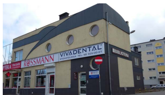
Figure 10. Public utility building, Gdynia, Stryjewskiego street, Poland

The round window resembling a porthole is a commonly recurring, popular naval reference which appears in present-day buildings. The round window is used regardless of its actual function or the size and location of the building (Figure 9, 10).