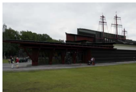
Figure 12. Vasa Museum, Stockholm, Sweden.

Among many famous buildings in Stockholm, the Vasa Museum is especially worthy of mention. The form of the buildings modelled on the ship's hull, with its masts visible from far away, houses a reconstructed model of the Vasa ship which sank in 1628 when on its first voyage. The architects from MånssonDahlbäckArkitektkontor designed the building to look like a ship resting at anchor by the embankment (Figure 12).