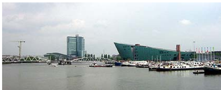
Figure 11. NEMO Science Centre, Amsterdam, Holland

NEMO Science Centre is one of the most recognisable buildings in Amsterdam. Designed by Renzo Piano, the building resembles the hull of a ship which has laid anchor in the middle of the city. The ship-inspired form provides an interesting dominant, including also with regard to its colour. The building towers over its surrounding. Its roof, sloping down in steps, is a terrace used as a meeting place by tourists and locals alike. The building has an unusual location. It arches over the entry to an underground tunnel running beneath the IJ river, and connects the southern and the northern parts of the city. This location makes the building look as if it is emerging from the water (Figure 11).