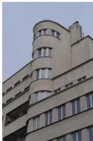
Figure 4. BGK residential complex, Gdynia, 3-ego Maja street, Poland