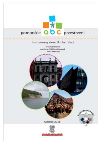
Figure 2. The dictionary Pomeranian ABC of Space

The Introduction provides the teacher with all the necessary guidelines for implementing the programme, such as educational assumptions and aims, required tools and materials, as well as tips on workspace arrangements.