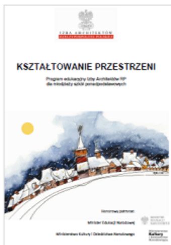
Figure 1. Shaping Space Programme.

Each of the parts consists of Introduction , ten lesson scenarios with the necessary teaching materials, student's worksheets, thematically related homework and proposals for interdisciplinary activities suitable for a number of different classes.