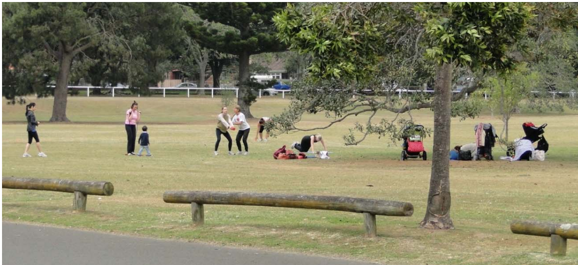
Figure 3. Sydney, Centennial Park. Mothers’ exercise group

to home – which are issues of a more organizational nature, not connected with the spatial aspects of physical activity. An example of well-organized activities in public spaces can again be found in Australia, where the so-called “mothers’ groups” – local groups of women from the same community or neighbourhood, mothers of babies and toddlers – meet for joint exercises (Figure 3). Activities are held in public parks, information can be found on the internet. Trees and the surrounding silence create favourable conditions for sleeping and playing children, while their mothers exercise together and take turns looking after them.