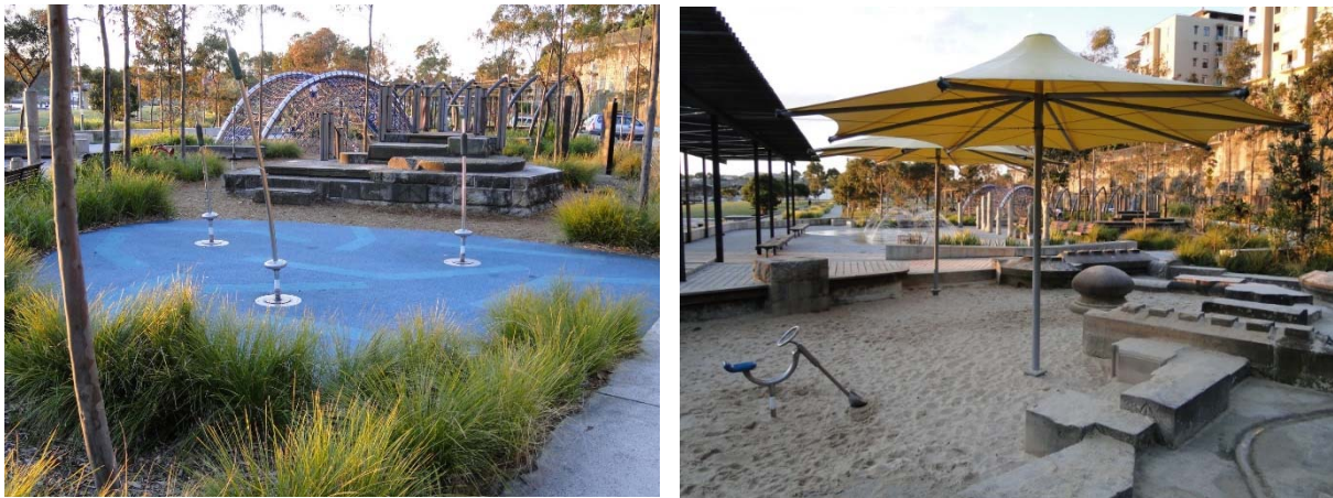
Figure 2. Sydney, Pyrmont. Physically activating public spaces for young and older

Examples of friendly, integrating, and activating public spaces can be found in Sydney (Figure 2). Their significant feature is that they allow the users to enter into the landscape, and even be its integral part. The design of playgrounds and activity spaces is treated as the art of landscaping, which takes into account all natural values: terrain morphology, local building materials and plant species, and local history. Such places have no clear boundaries and they seamlessly fit into the environment. They contribute to the strengthening of spatial order. Equipped with small architecture elements, seats, water facilities, play and sports areas, as well as places to relax and to be active, these spaces are friendly both to very young and adult users, also in terms of undertaking physical exercises.