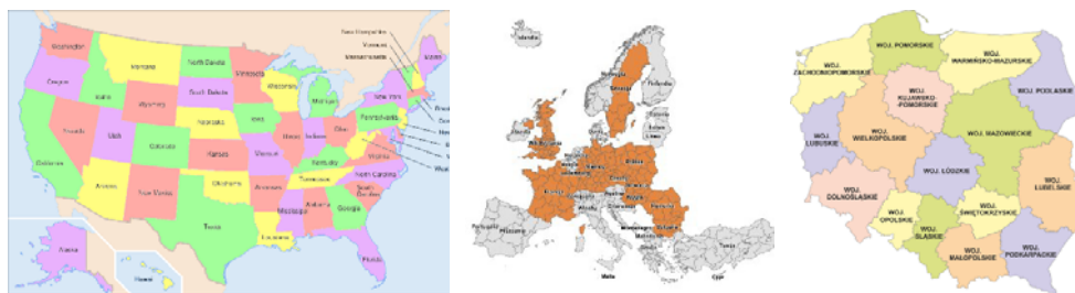
Fig. 1. Analysed regions in particular data groups.

Road safety on the US road network was analysed using data from 51 states. In the case of EU regions, data were collected from 188 NUTS 2 regions of the following countries: the United Kingdom, Czech Republic, Germany, Poland, France, Spain, Slovakia, Hungary, Sweden, Bulgaria and Romania. In Poland, the analysis looked at 16 regions (voivodeships) (Fig. 1). The time period under analysis in all the cases spanned from 1999 to 2008 with Polish regions as the exception because the data covered the years 1999-2014. Detailed analyses of the levels of road safety in groups of regions showed significant differences between them.