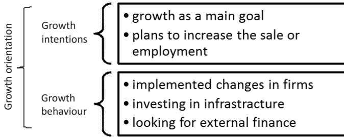
Figure 2. Growth orientation index used in research

Figure 2 shows the index of growth orientation, which consists of growth intentions and growth behaviors, together with the indicators that define them.