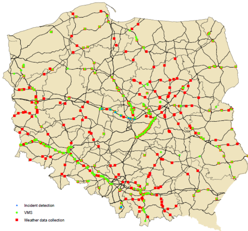
Fig. 1. Selected ITS devices on Polish national roads in 2015 [own study based on GDDKiA data]