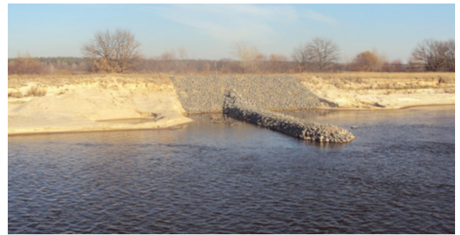
Fig. 2. Example of a side-spur on the Pripyat river

Analysis of the Pripyat river’s longitudinal profile indicates that even full implementation of hydrotechnical works required to improve the fairway will not allow full use of vessel