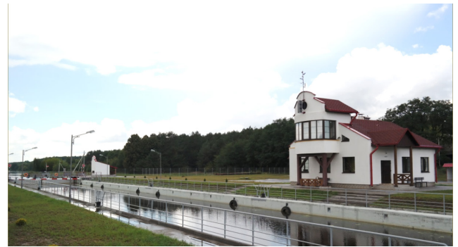
Fig 1. Water junctions no. 10 “Załużie” on the D-BC

The above concept has been implemented since 2015. In particular, design and preparation works are being carried out for the construction of shipping lock no.3 Ragodoszcz. The total cost of reconstruction and locks’ construction on the eastern section will amount to EUR 19.5 million.