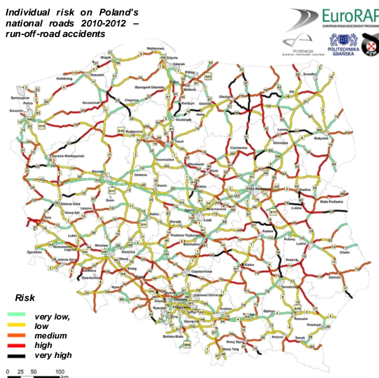
Figure 3 Map of individual risk on national roads – run-off-road accidents

A major problem for this level of management is to obtain permits to fell roadside trees posing a hazard to road users. The process can be helped by a recent Supreme Chamber of Audit report on road safety management which addresses this particular problem (NIK, 2014). Operational risk management occurs primarily when road structures are built, operated and deconstructed. This is delivered by local road authorities and local authorities.