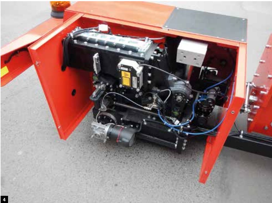
Figure 4: Details of the R 2 Mk.2 trailer

A full discussion of these conditions follows in the sections below.