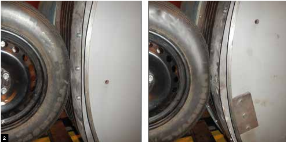
Figure 2: Sinusoidal replica that imitates extremely uneven pavement