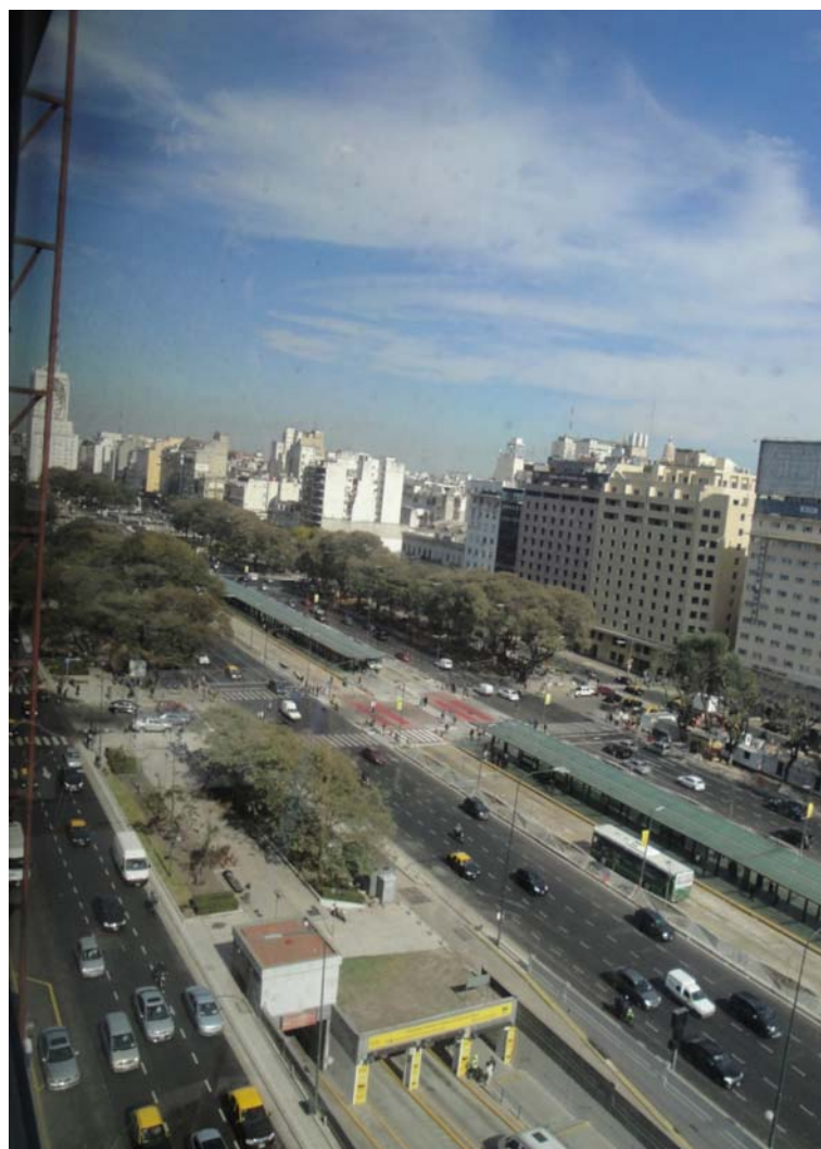
Figure 5. High-capacity BRT corridor famous Avenida 9

In 2013, Buenos Aires transformed its iconic 9 de Julio avenue (Figure 5), one of the widest avenues in the world with 20 lanes of car traffic, into an efficient, modern public transit corridor, by replacing four lanes of open vehicular traffic with dedicated busways [12]. From the point of view of transport hierarchy, one may question, if this corridor should be parallel to an existing sub-way. Still, it is the transformation of the most significant urban corridor and benefits of this process are unquestionable. Nearly 200,000 passengers and up to 10 bus lines benefit from the project. Another aspect of this is the reduction in commute time: by 50 % for busses, 40 % for minibuses and 20 % for cars. All three BRT corridors in Buenos Aires result in estimated GGE reduction of the equivalent of 49,000 CO 2 tons a year.