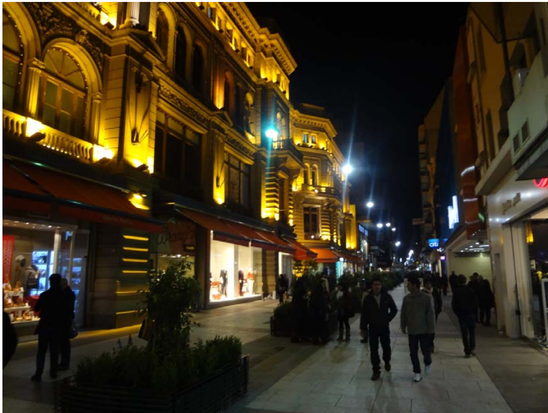
Figure 6. Newly-pedestrianized blocks in the downtown “microcentro”

decrease private vehicle use [1]. Also a public bicycle rental system was launched in 2010. In 2013 there were 31 free bike stations, 80,000 users making 5,000 daily trips and parking in 2,816 street bike spaces. The Mayor of Buenos Aires has announced the expansion of the number of bikes up to 3,000, with about 200 stations. The above-mentioned investments had increased bike usage in the city from 0.4 % in 2007 to 2.5 % of all the trips in 2015 [13].