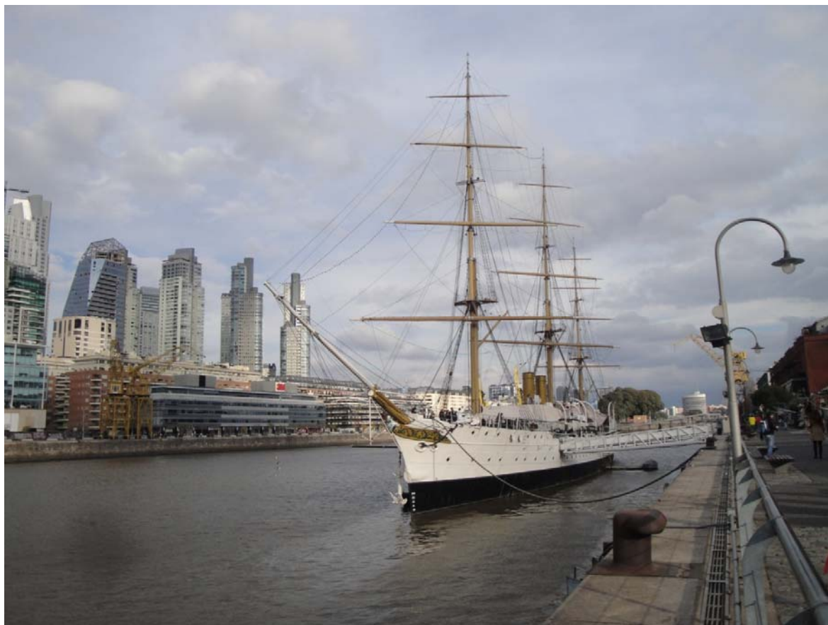
Figure 3. Recent waterfront urban regeneration in Puerto Madero, Buenos Aires

The most significant, large scale, development project which was completed within the last years is the urban regeneration of Puerto Madero. This development could be compared to other waterfront projects such as London Docks, Hafencity in Hamburg or Battery Park City in New York. At the same time, because of larger disparities in Buenos Aires than in other European and North American cities as well as because of its airy urban layout contrasting with Buenos Aires' dense city grid, this high-end development has even bigger impact on the city than it had in the case of London, Hamburg or New York [11].