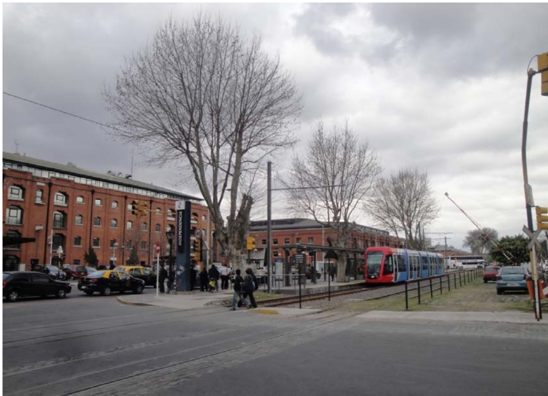
Figure 1. New tram line in Puerto Madero, Buenos Aires

The modern tram 'Premetro' opened in 1987 is serving the new development of Puerto Madero and is integrated with subway line E, but City transport priorities lay, as in the majority of Southern American mega cities, in the development of Bus Rapid Transport system [5].