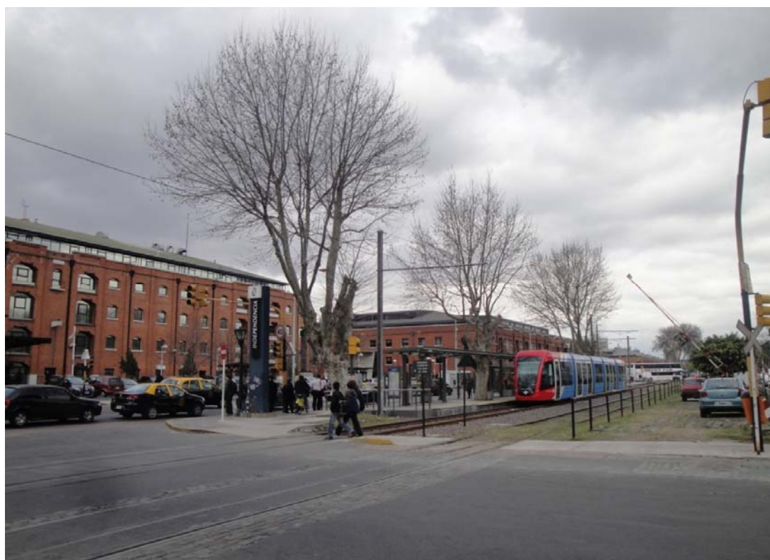
Figure 1. New tram line in Puerto Madero, Buenos Aires

The modern tram 'Premetro' opened in 1987 is serving the new development of Puerto Madero and is integrated with subway line E, but City transport priorities lay, as in the majority of Southern American mega cities, in the development of Bus Rapid Transport system [5].